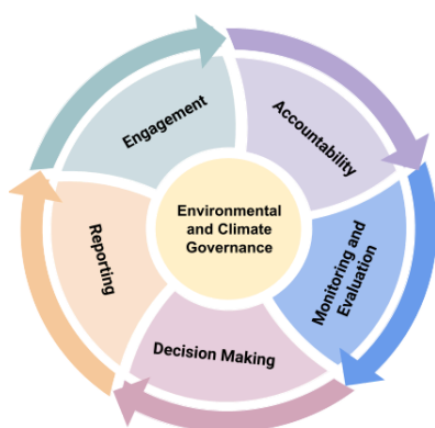
Exhibit 1: Elements of an effective approach to climate governance