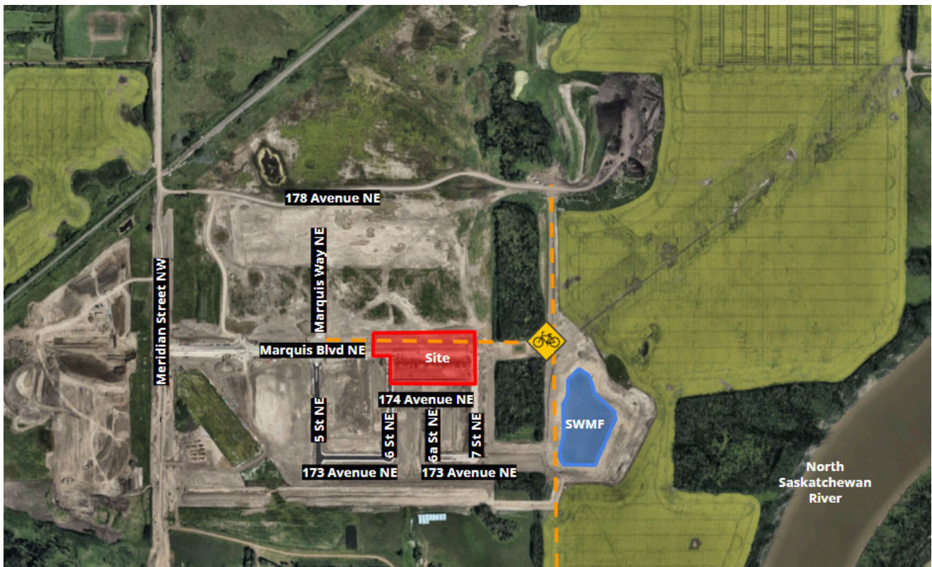
Site analysis context