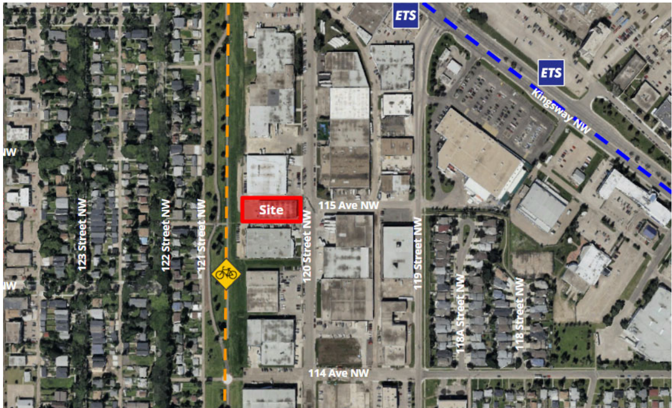
Site analysis context