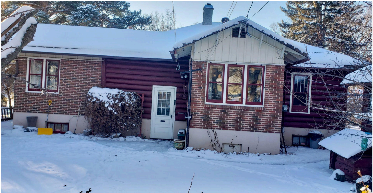
View of east (rear) elevation, looking west