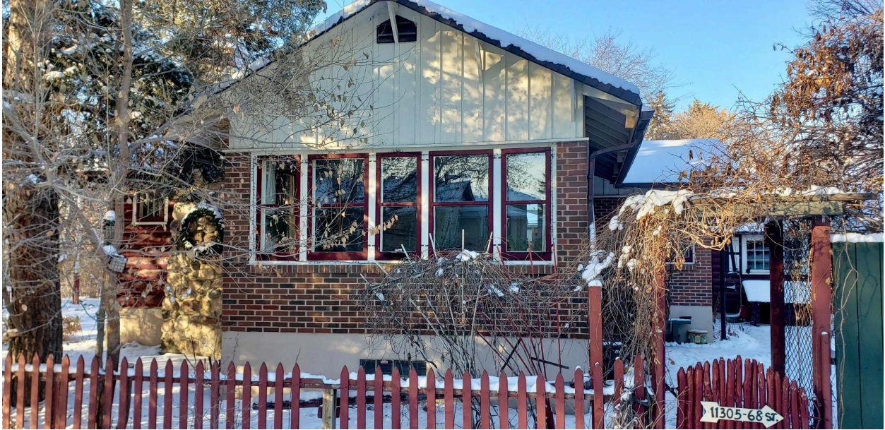
View of south elevation, looking north from 113 Avenue NW