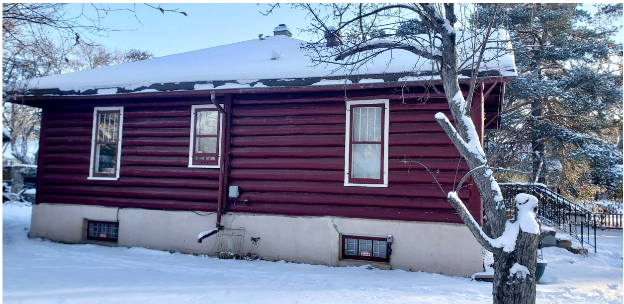
View of north elevation, looking south