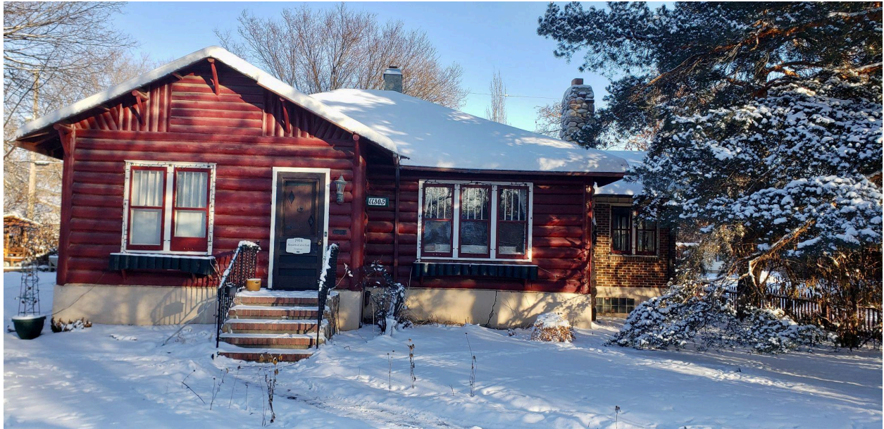
View of west (front) elevation, looking east from 68 Street NW