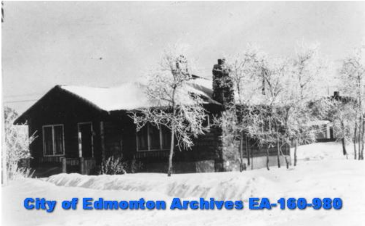
Historical photo of the Field Log House from the corner of 113 Avenue and 68 Street NW, ca. 1934