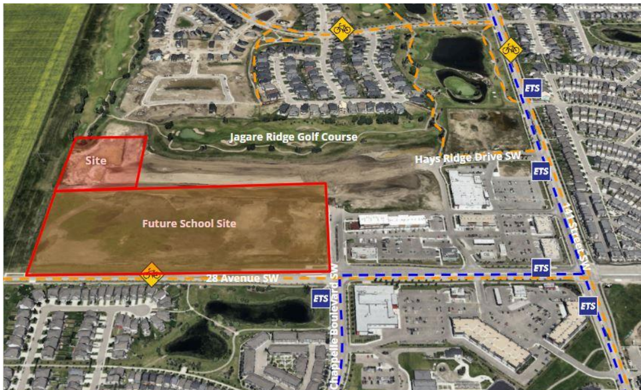
Site analysis context