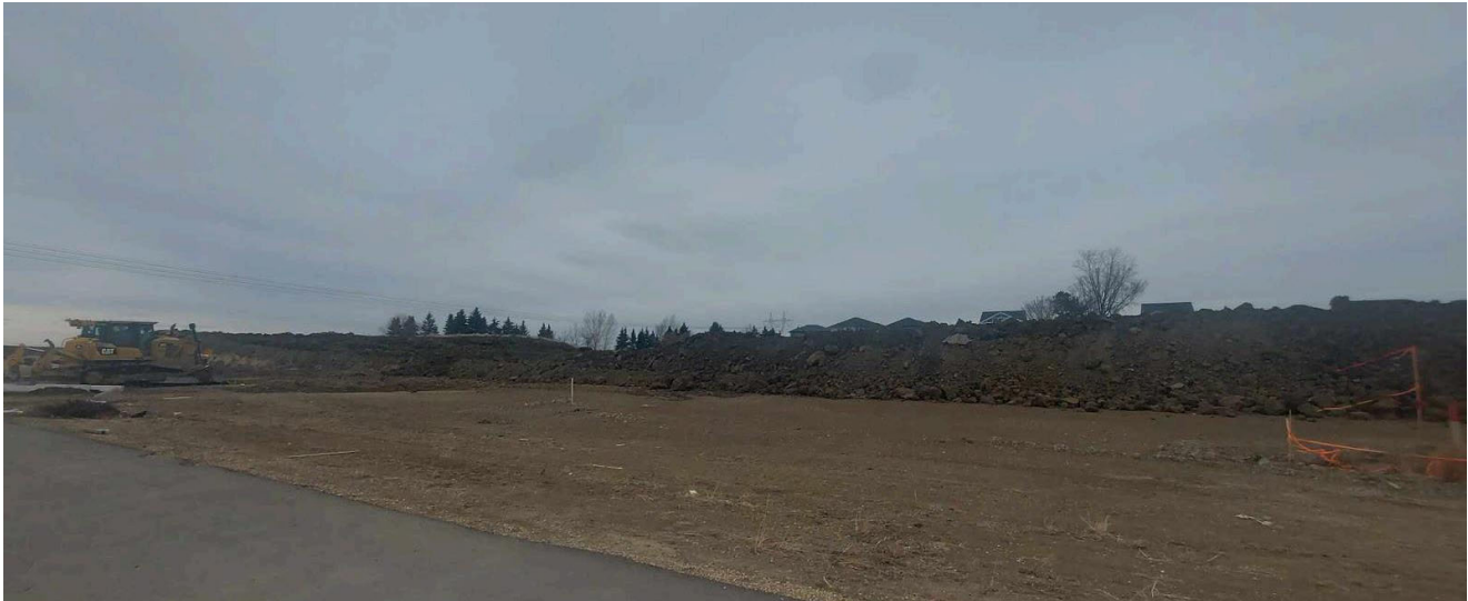
Photo 1: Looking northwest from Hays Ridge Boulevard, across the proposed RM h16 site