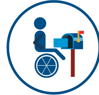
MAILED NOTICE Feb 26 & Mar 14, 2024