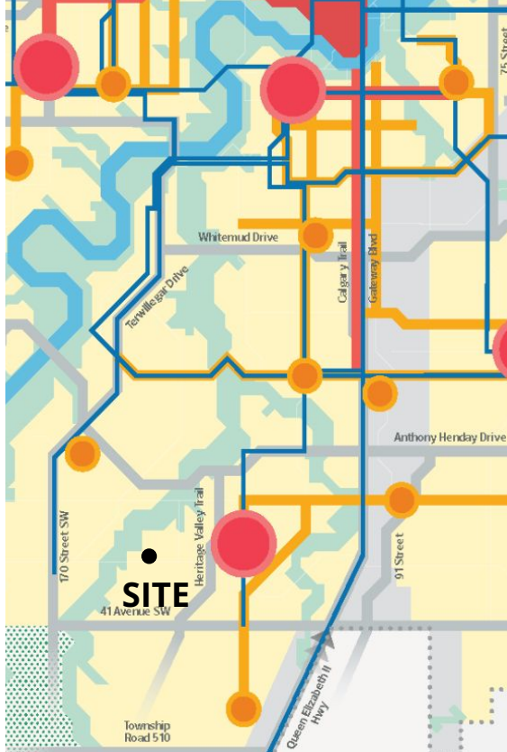
THE CITY PLAN