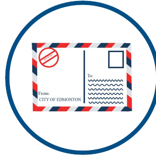
PUBLIC HEARING NOTICE May 16, 2024