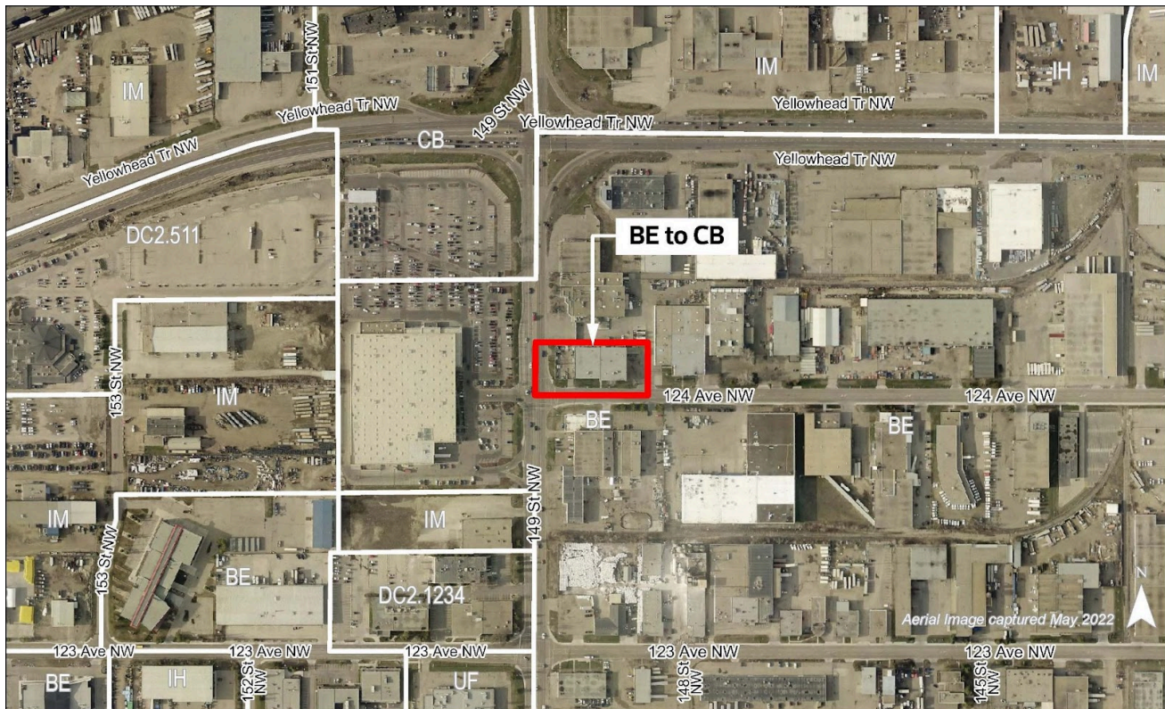
Aerial view of application area

The developed site is approximately 0.39 ha and is located on the northwestern edge of the Dominion Industrial neighbourhood. The Dominion Industrial neighbourhood comprises a mix of commercial and medium industrial uses, including retail, warehousing, manufacturing and business offices. The site is surrounded by land with long-standing business uses, including flooring superstores, offices, Costco, and Church in the Vine (religious assembly).