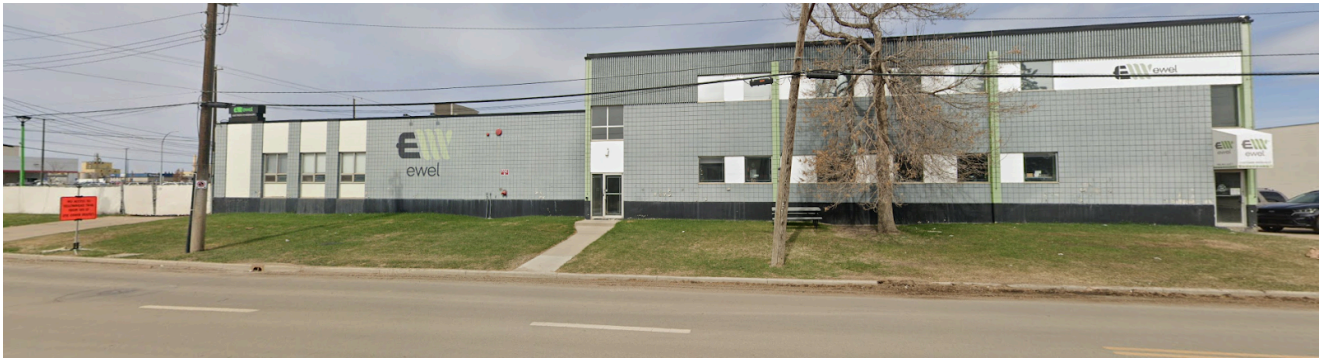
View of site looking north from 124 Avenue NW