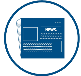
JOURNAL AD May 24, 2024 & Jun 1, 2024