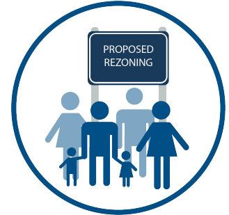
SITE SIGNAGE May 6, 2024