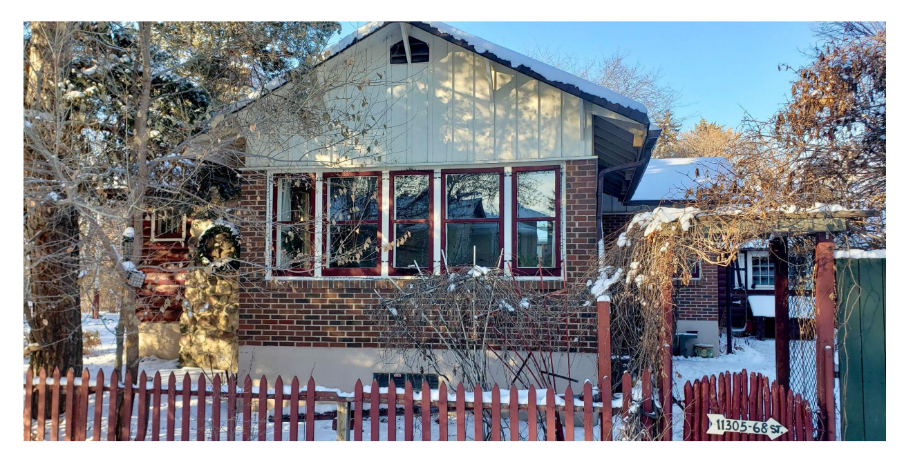
View of south elevation, looking north from 113 Avenue NW