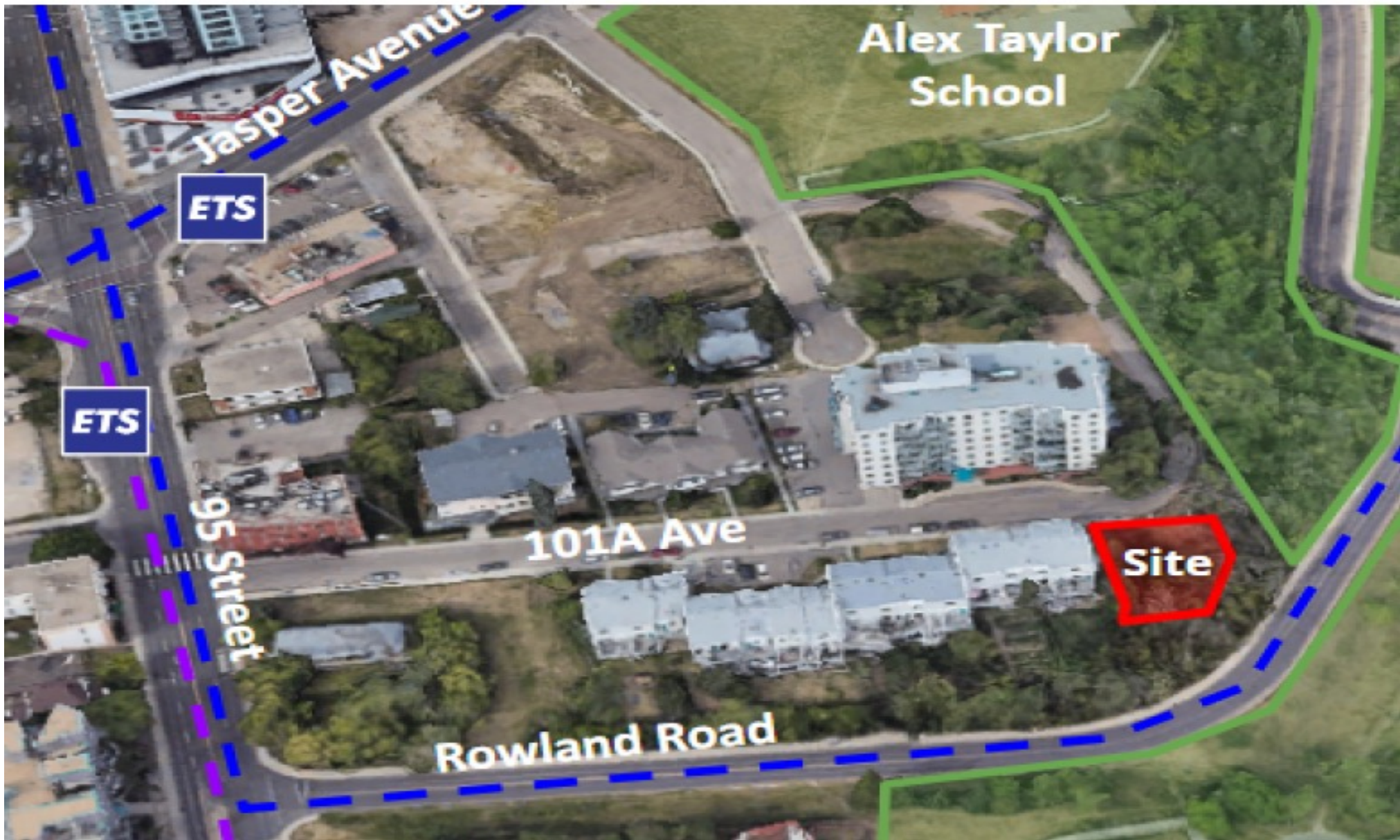
Site for the Proposed Riverdale Outlook