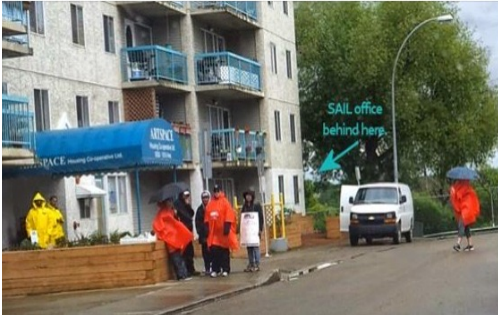
S.A.I.L office is located on East side of Artspace