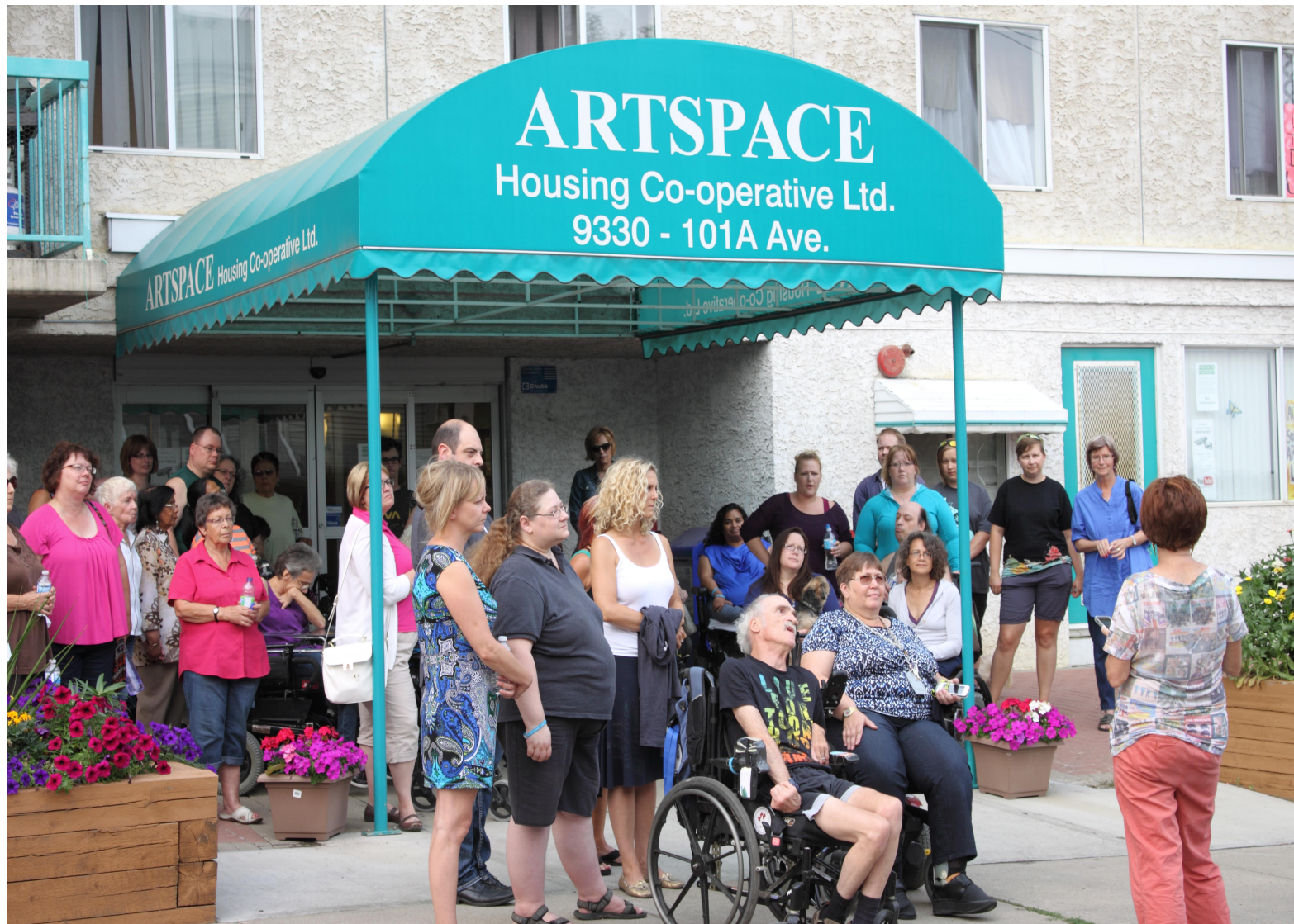
ARTSPACE HOUSING CO-OPERATIVE