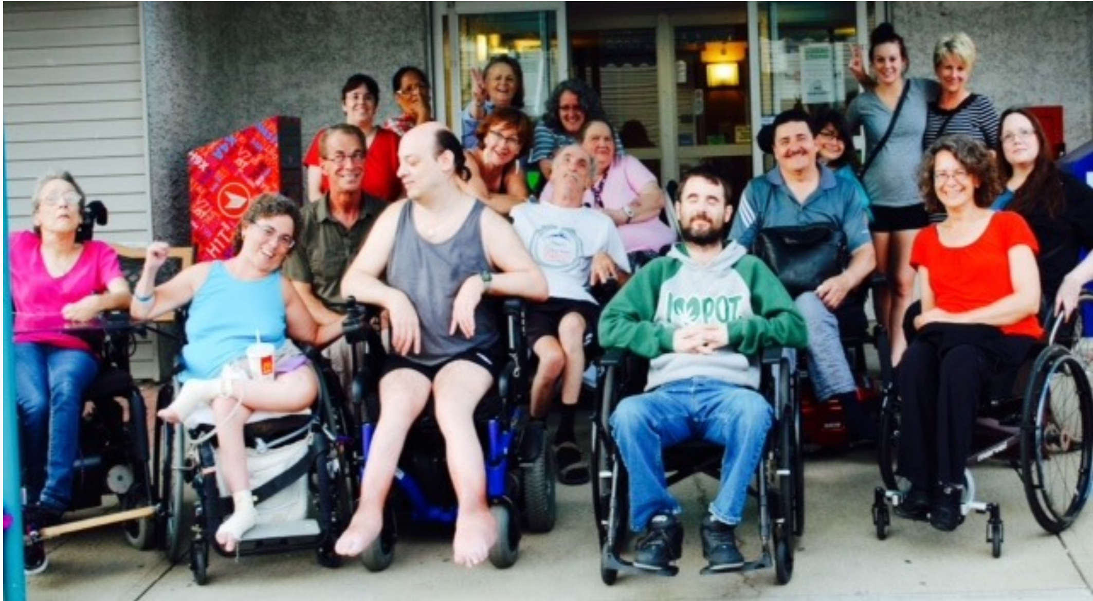
Consumers of S.A.I.L homecare support