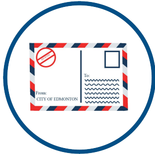
PUBLIC HEARING NOTICE May 16, 2024