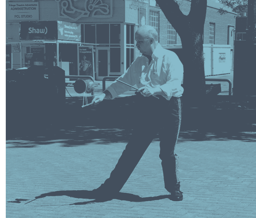
Street performer Kim-Possible at the Edmonton International Street Performers Festival.

These four principles were the priorities that had to be addressed in developing a cultural plan. They made the engagement design as inclusive and comprehensive as possible, and ensured the collection of input from equity-seeking groups and communities.