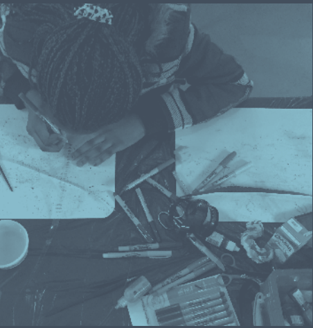
First FAVA Youth Film Fair.

Grier is a new parent. While she and her partner read as much as they could about what life would be like after their baby, she wasn't prepared for how lonely she would feel, especially compared to her previous lifestyle. Every day, she takes the baby for walks and spends time in parks where there are other people. Still, it is hard to make friends and all her old friends go to work during the day. One day, while walking near a community strip mall, she notices a truck loading pottery equipment and easels into a long-vacant storefront. A week later, she notices a sign on the storefront: "Art Classes and Studio Space—Coming Soon." Looking through the window, she sees a proud, but exhausted, woman setting up. Grier knocks on the window to get her attention and learns they are offering not only drop-in studio space for artists, but a chance for those artists to teach courses. When the space opens, Grier signs up for a "Parent and Baby" pottery class that gives her two hours each week to meet and talk with other parents in her neighbourhood.