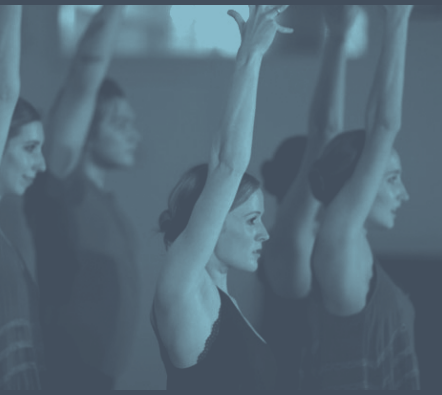
Ballet Edmonton performs during Alberta Culture Days.