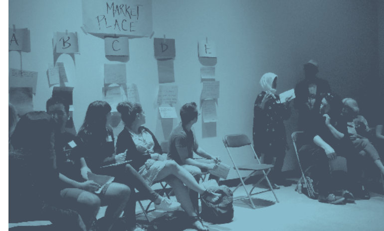
Equity workshop with ALIF Partners.

In order for the plan to be as accountable and optimized as possible over its 10-year lifespan, a MEL framework was developed not only to serve the plan over the next decade, but to ensure that the plan would be measurable from the outset, rather than waiting well into the plan to determine if it is working as effectively as possible. This holds the implementing organizations accountable to the public and stakeholders.