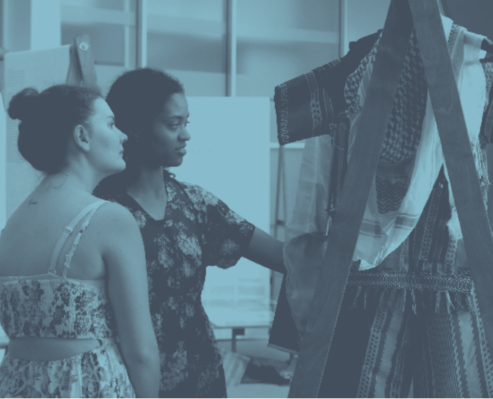
Sharing stories of the newcomer experience at the launch of the Edmonton Living Rooms exhibit at La Cité Francophone.

The five pillars that define how the MEL Framework will be carried out are: