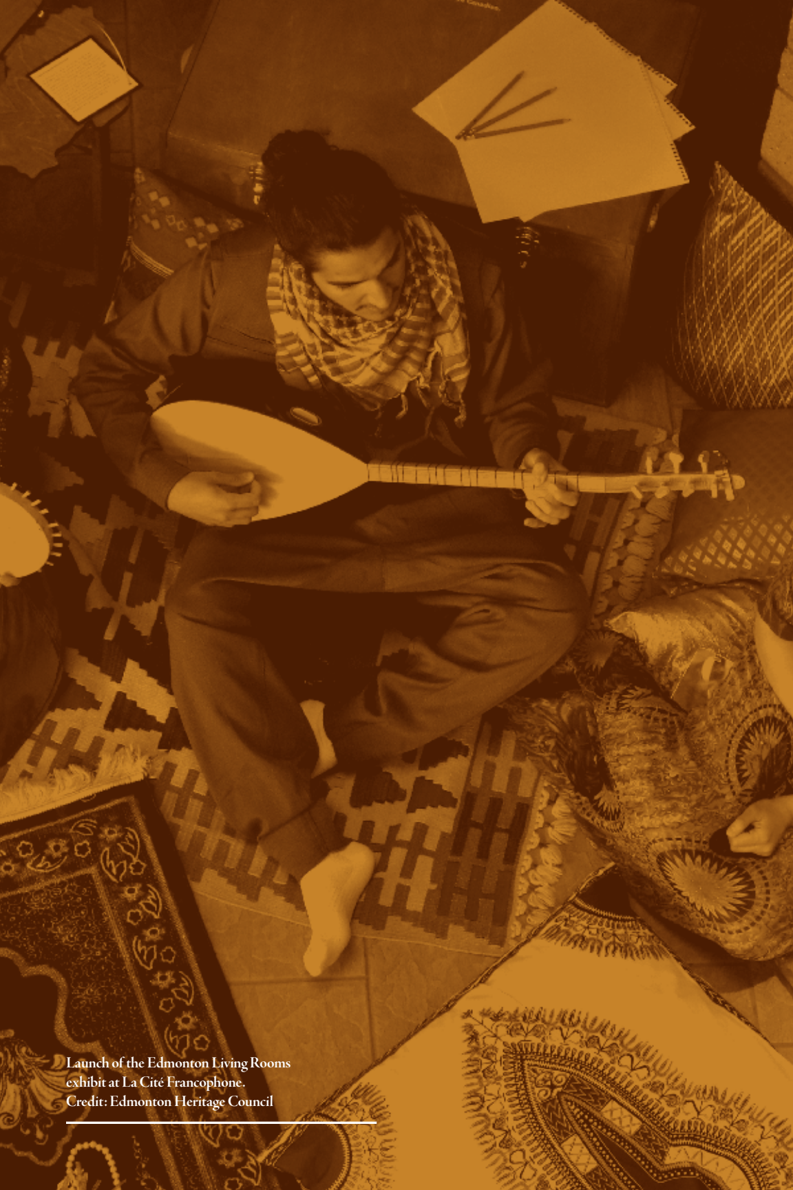
Launch of the Edmonton Living Rooms exhibit at La Cité Francophone.