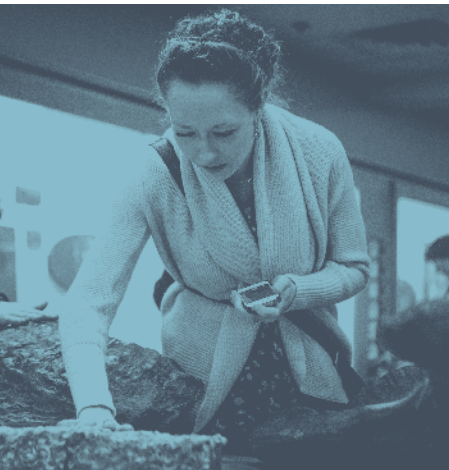
Getting up close with Edmonton's heritage on an Edmonton City as Museum Curiosities Tour.

Edmonton isn't a finished city. That's its greatest asset. It's this notion that drives everything this city does. There is always room to get involved and get something done. Every day, the desire and opportunity to create impactful, dynamic change in this city grows stronger. The productive, kinetic energy in the people, organizations and institutions of this city has—over the last decade—provided direction and guidance to make Edmonton a place of transformative change. You can see it every day—not just in the cranes that dot the sky, but in the eager people that arrive here daily; the ideas and effort that has been put into our communities, the careful investments of time and capital; or simply in the healthy debate around our evolving civic identity. We are a city collectively striving to create something new and distinguish itself to the world. This potent and vibrant energy of change is what makes Edmonton such an extraordinary place to live—it isn't perfect, but everyone is welcome to make it better, and everyone can play a part in the collective project of shaping and transforming this city.