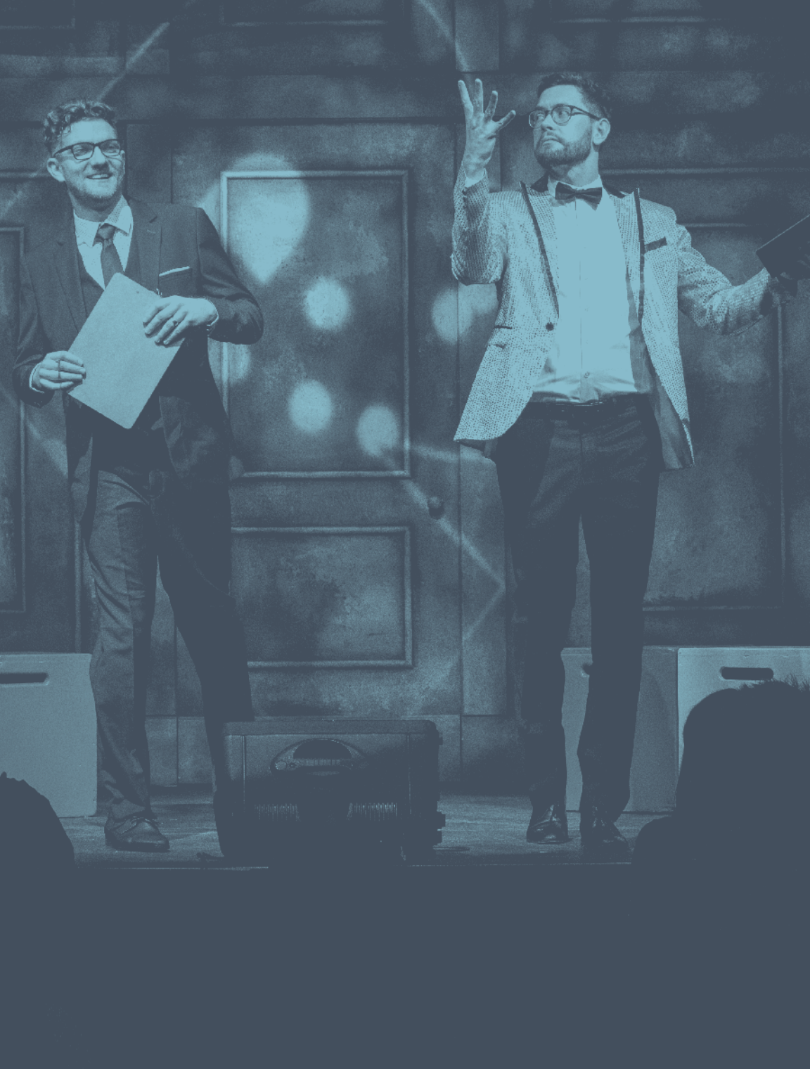
Rapid Fire Theatre's Improvaganza Festival.