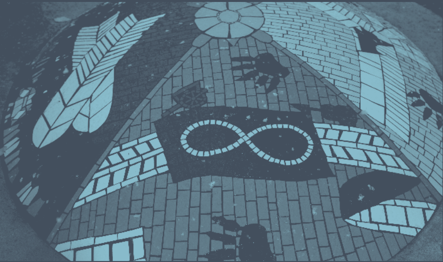
"mamohkamatowin" (Helping Each Other) by Jerry Whitehead in \Delta\sigma\circ (INIW) River Lot 11 \infty . Credit: Brad Crowfoot

Connections & Exchanges was developed at the same time as the City of Edmonton's new strategic plan. The ambitions , aims and actions that make up Connections & Exchanges were influenced by, and are purposefully aligned with, the vision, principle and goals emerging from that process. In fact, in the context of Council's Strategic Plan, Connections & Exchanges is designed to play a critical role in city-building by delivering necessary cultural development. In order to be effective in the long term, this plan needs to work hand-in-glove with the planned direction the city is taking. Connections & Exchanges seeks to be a steady and long-standing companion to the City's strategic plan.