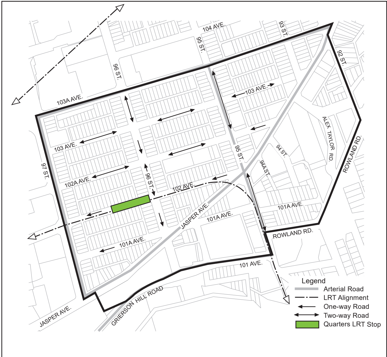
Figure 3 - Transportation