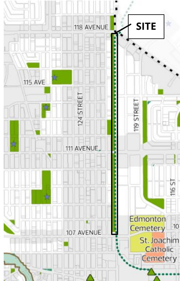
DRAFT CENTRAL DISTRICT PLAN