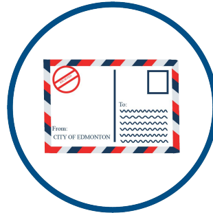
PUBLIC HEARING NOTICE June 6, 2024