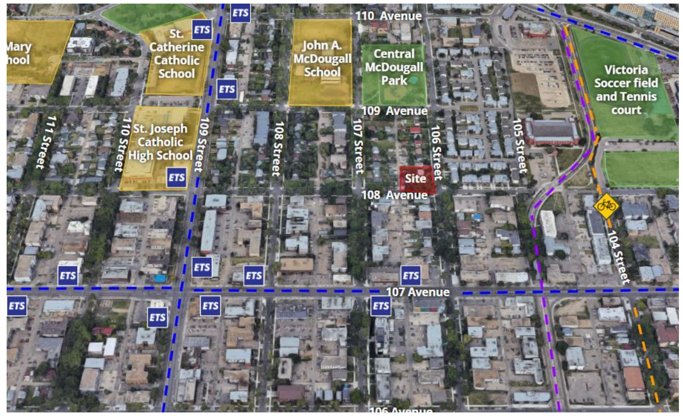
Site analysis context

The subject sites are located on a corner site, adjacent to the Centre City Node and abutting a small scale residential development on the north. With a maximum height of 16.0 metres and a Floor Area Ratio of 2.3, the proposed RM h16 allows for a larger structure than permitted under the existing RS Zone.