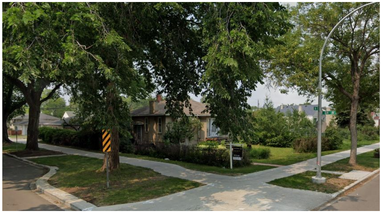
View of the Sites looking northwest from 106 Street NW & 108 Avenue NW