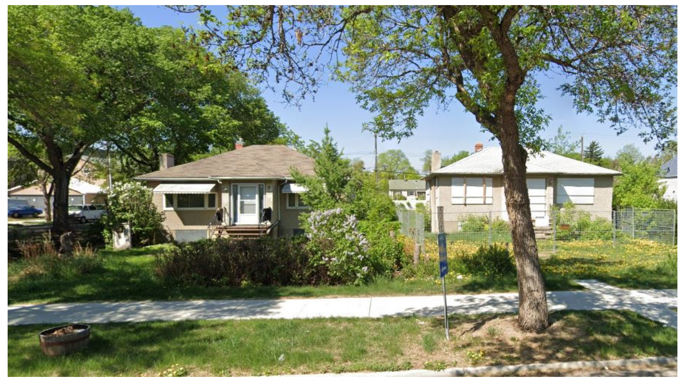
View of the Site looking west from 106 Street NW