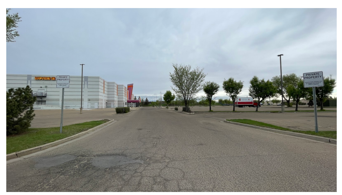
View of the rezoning site looking north from 130 Avenue NW