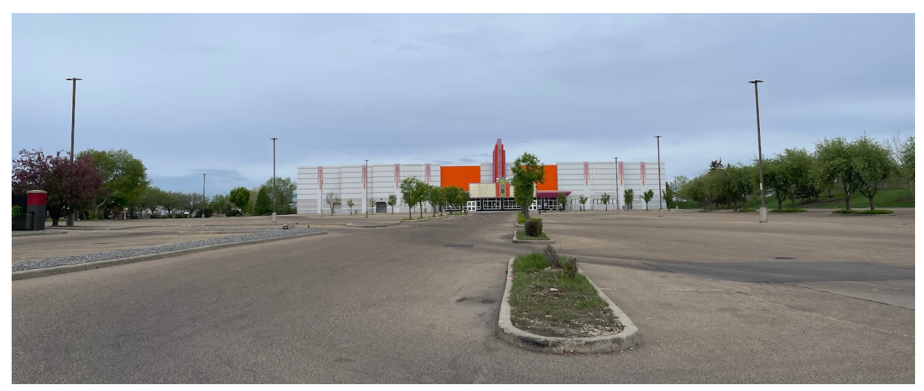
View of the rezoning site looking west from 50A Street NW