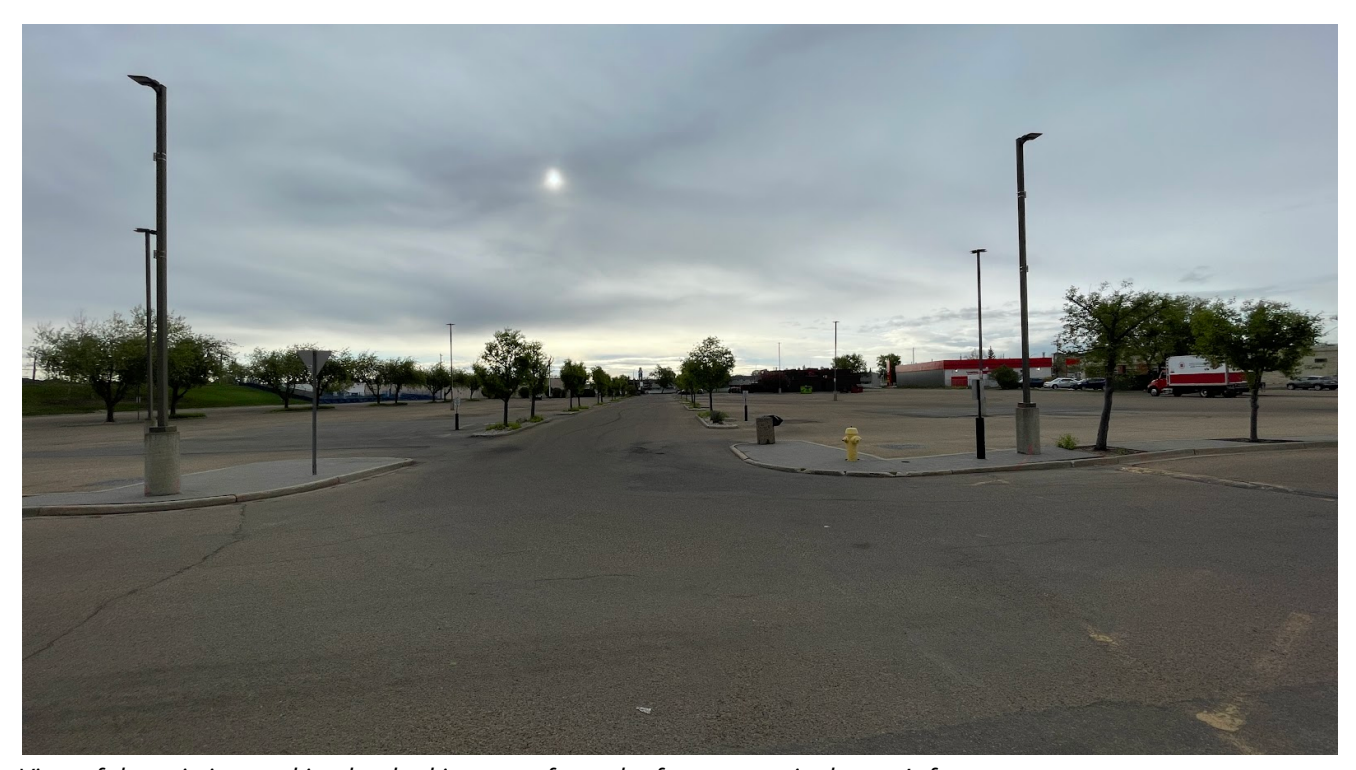
View of the existing parking lot, looking east, from the former movie theatre's front entrance