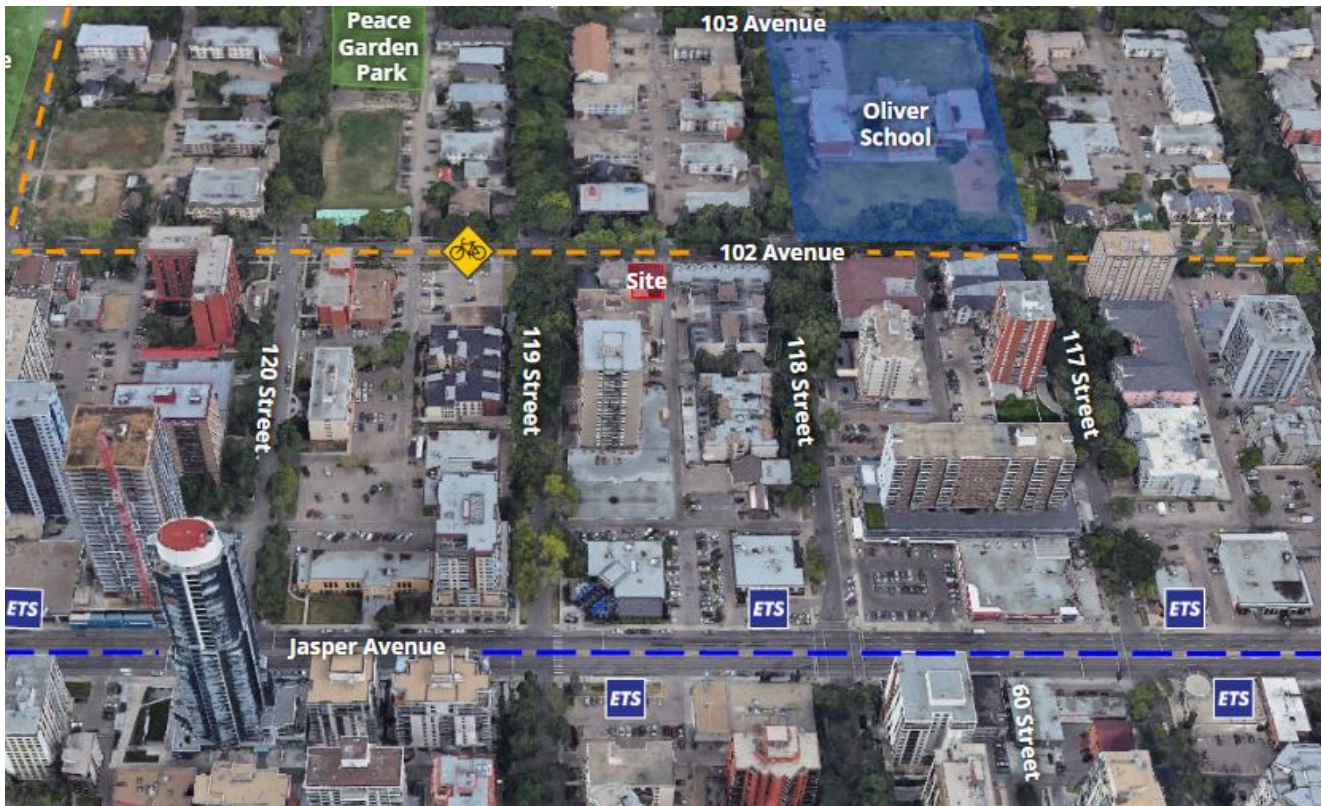
Figure 2 - Site analysis context

The subject site is located along 102 Avenue NW and currently houses an existing legal non-conforming commercial building. The existing RM h23.0 Zone allows commercial use only at the ground level and currently, the whole building is used for commercial use. Therefore, the current use of the building does not conform with the existing RM h23.0 Zone. The proposed rezoning will bring the existing building into compliance.