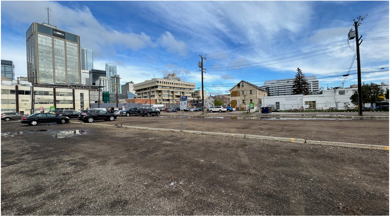
View of the rezoning area looking northwest towards downtown