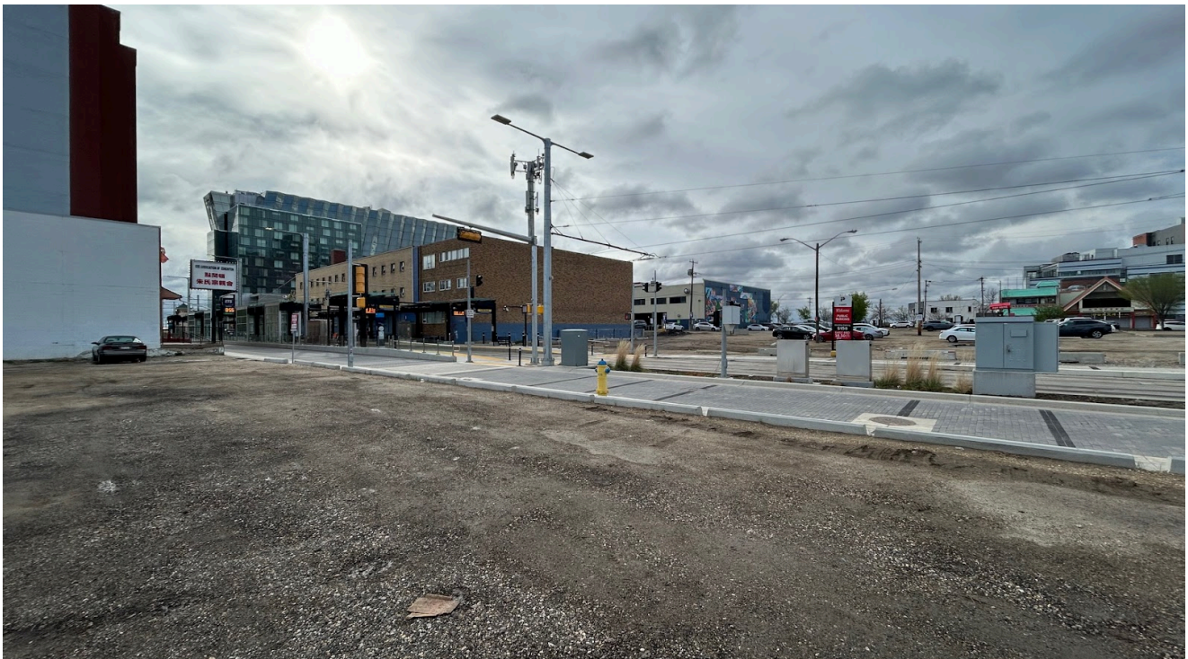
View of the rezoning area near The Quarters LRT Stop looking southeast

The Quarters area is bounded by 103A Avenue NW to the north, 92 Street NW to the east, 97 Street NW to the west and Jasper Avenue NW/101 Avenue NW to the south and encompasses 18 blocks. To the west of The Quarters is the downtown Arts District and the Civic Centre. To the south is the North Saskatchewan River Valley. To the east is the Riverdale neighbourhood and to the north is the McCauley neighbourhood. Approximately 43% (8.76 hectares) of the developable land being rezoned is vacant or underutilized, including many surface parking lots.