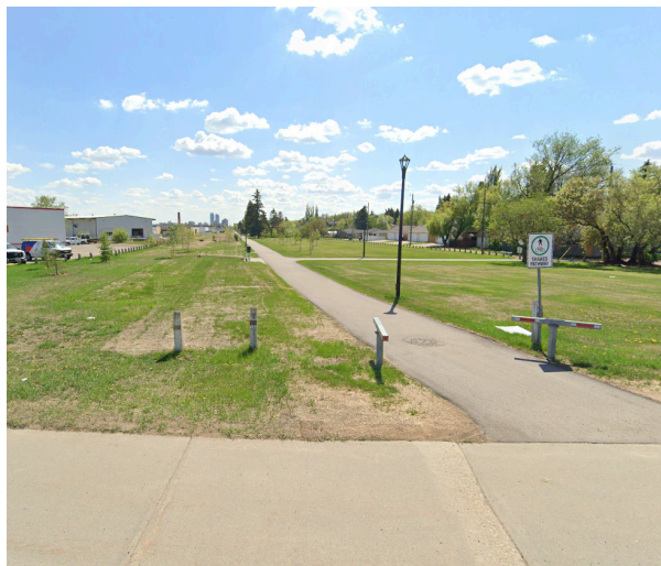
View of the site looking south from 118 Ave NW.