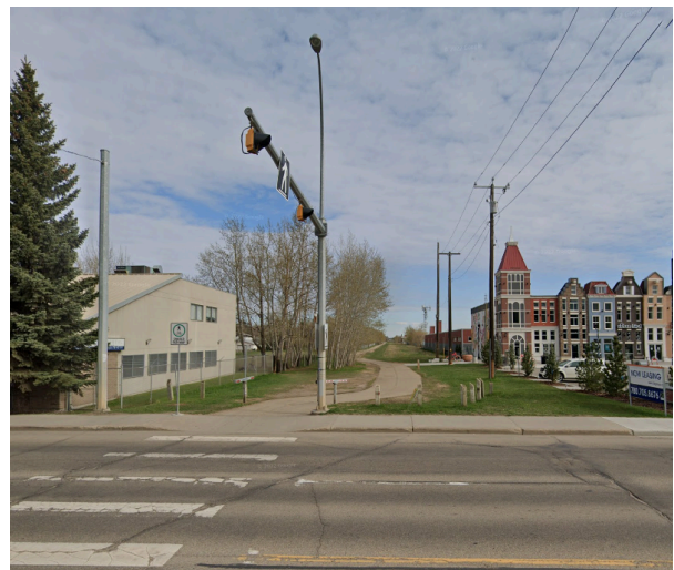
View of the site looking north from 107 Ave NW.