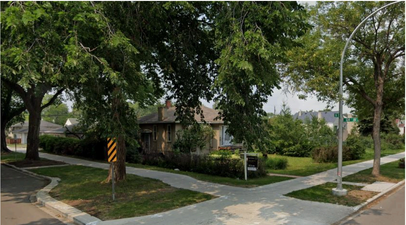
View of the Sites looking northwest from 106 Street NW & 108 Avenue NW