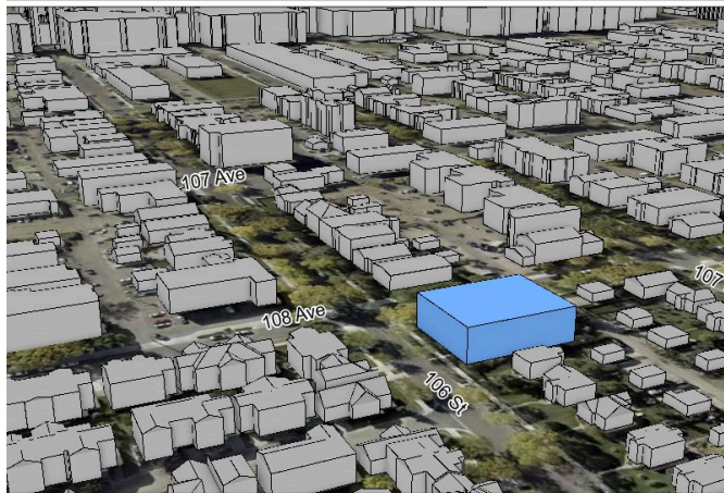
South 3D View