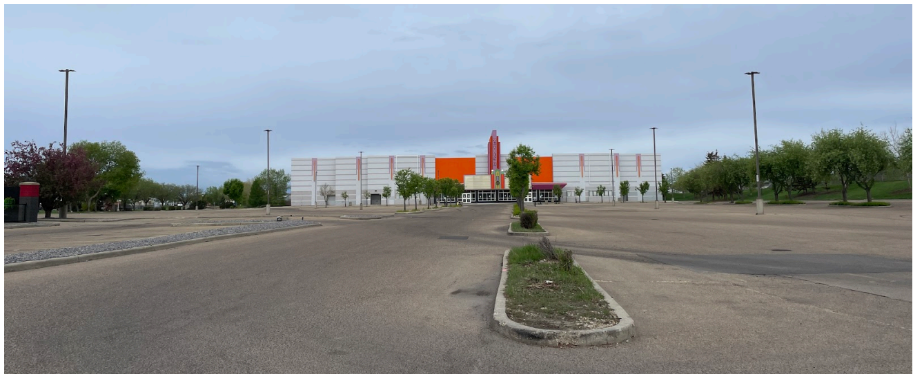
View of the rezoning site looking west from 50A Street NW