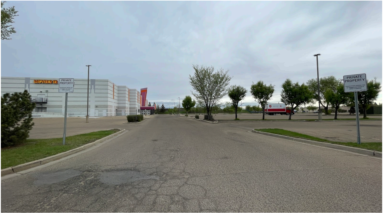
View of the rezoning site looking north from 130 Avenue NW