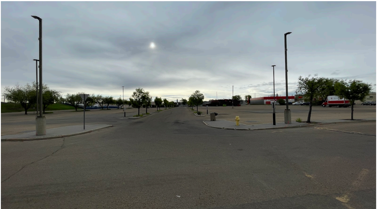
View of the existing parking lot, looking east, from the former movie theatre's front entrance