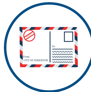
PUBLIC HEARING NOTICE June 6, 2023