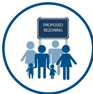
SITE SIGNAGE April 19, 2024