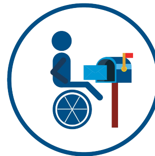
ADVANCED NOTICE March 5, 2024