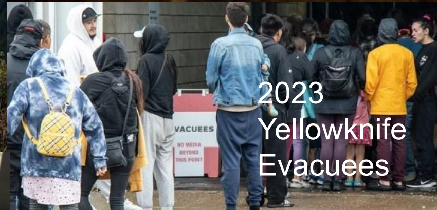
2023 Yellowknife Evacuees