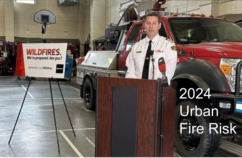
2024 Urban Fire Risk