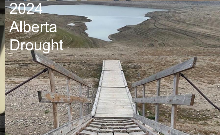
2024 Alberta Drought