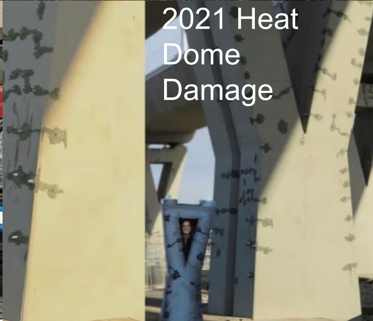
2021 Heat Dome Damage