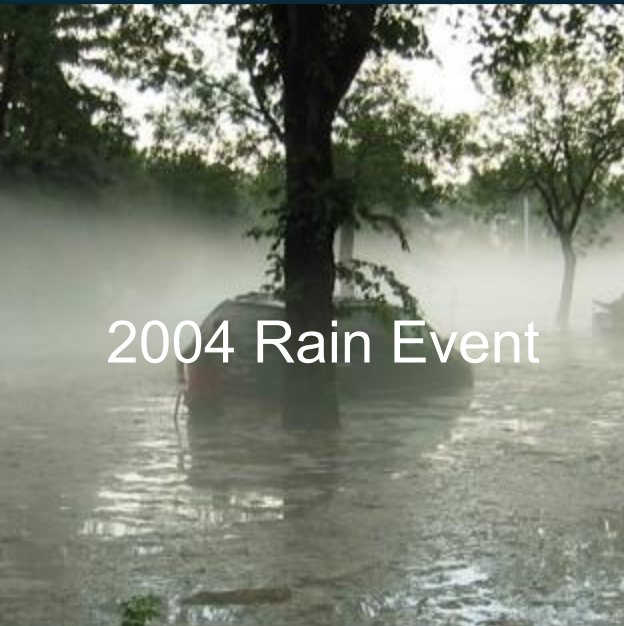
2004 Rain Event