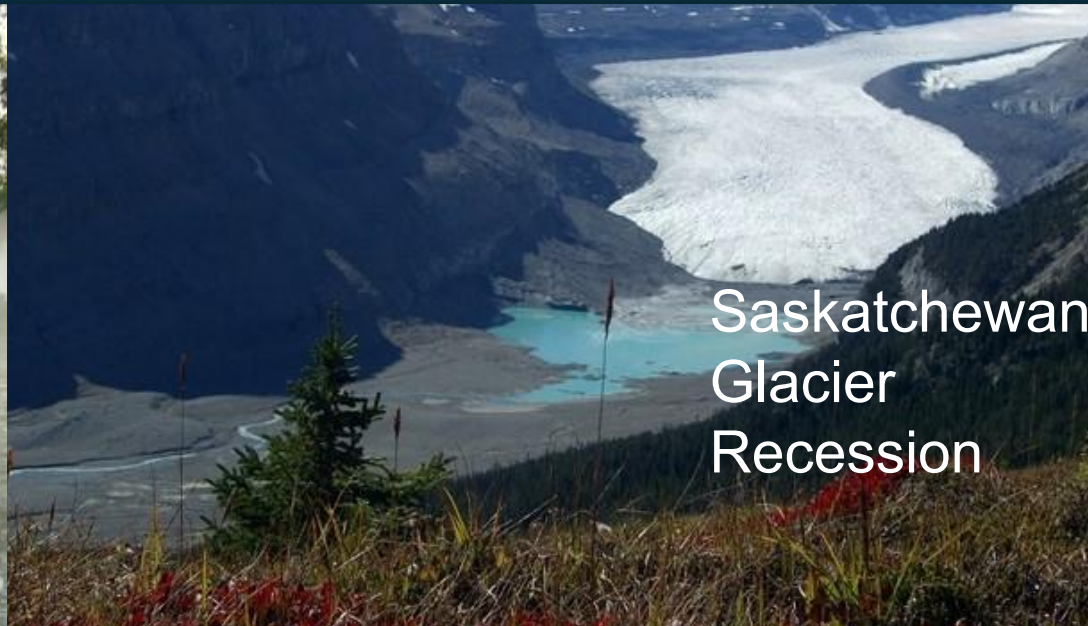
Saskatchewan Glacier Recession