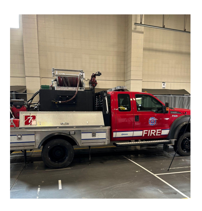
All Terrain Pump Trucks