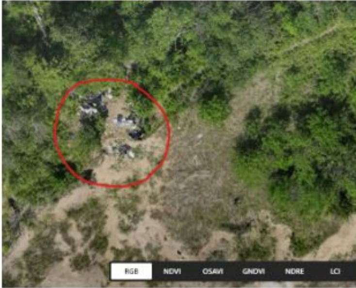
Monitoring of Natural Areas (encampment site)