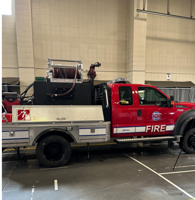
All Terrain Pump Trucks