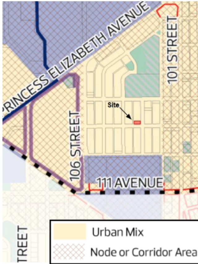
Map 4 (Land Use Concept to 1.25 Million) - Subject site designated as urban mix

The current RS Zone is consistent with the urban mix designation allowing up to 3 storeys in height. The proposed RSM h12.0 also allows for 3 storeys, but with an additional 1.5 meter of height and an additional 15% of site coverage. The District Policy provides direction for situations like this where additional scale can be considered, as long as the site can meet at least two contextual criteria. These criteria are outlined in the table below with an associated assessment of whether this site is compliant or not: