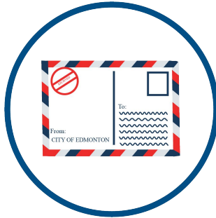
PUBLIC HEARING NOTICE Aug 15, 2024