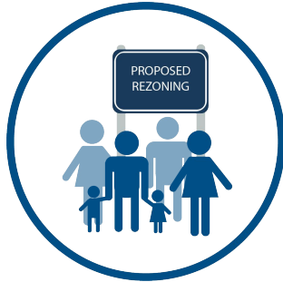
SITE SIGNAGE May 30, 2024