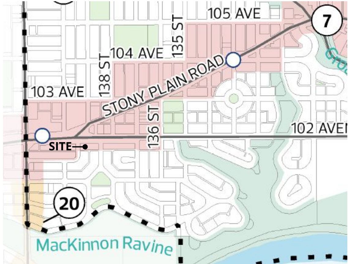
THE CENTRAL DISTRICT PLAN