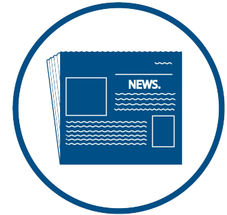
JOURNAL AD Aug. 23 and 31/24