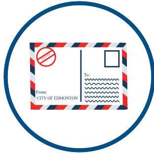
PUBLIC HEARING NOTICE Aug 15, 2024