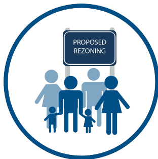
SITE SIGNAGE June 19, 2024