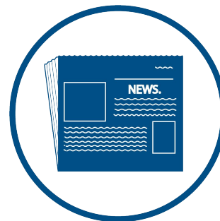
JOURNAL AD August 23 & August 31, 2024