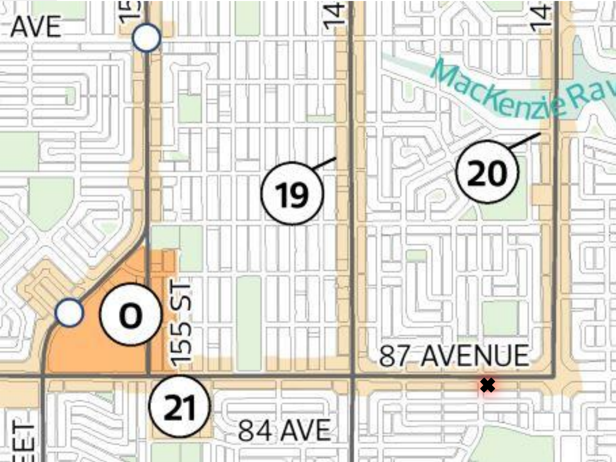
Map 3: Nodes and Corridors