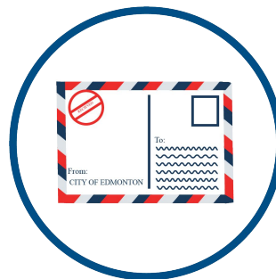
PUBLIC HEARING NOTICE August 15, 2024