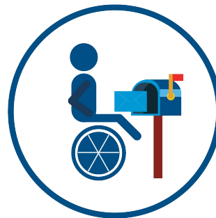
MAILED NOTICE April 26, 2024