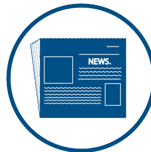
JOURNAL AD August 23 & August 31, 2024