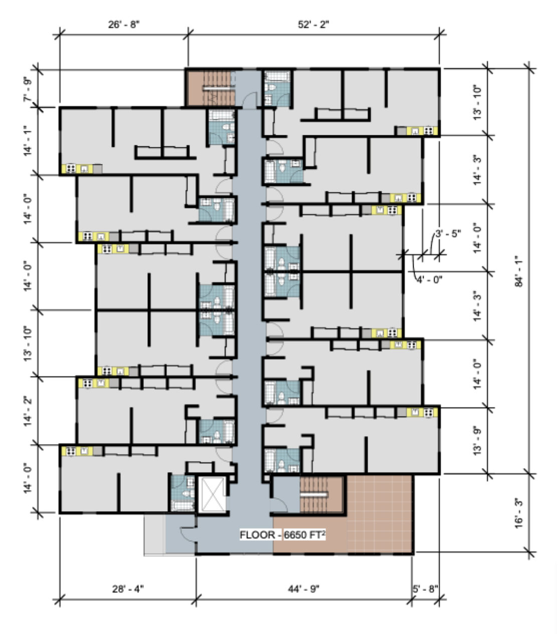
SECOND & THIRD FLOOR