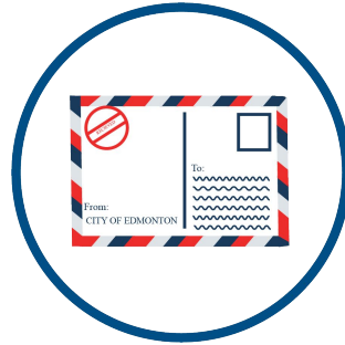
PUBLIC HEARING NOTICE Sep 5, 2024