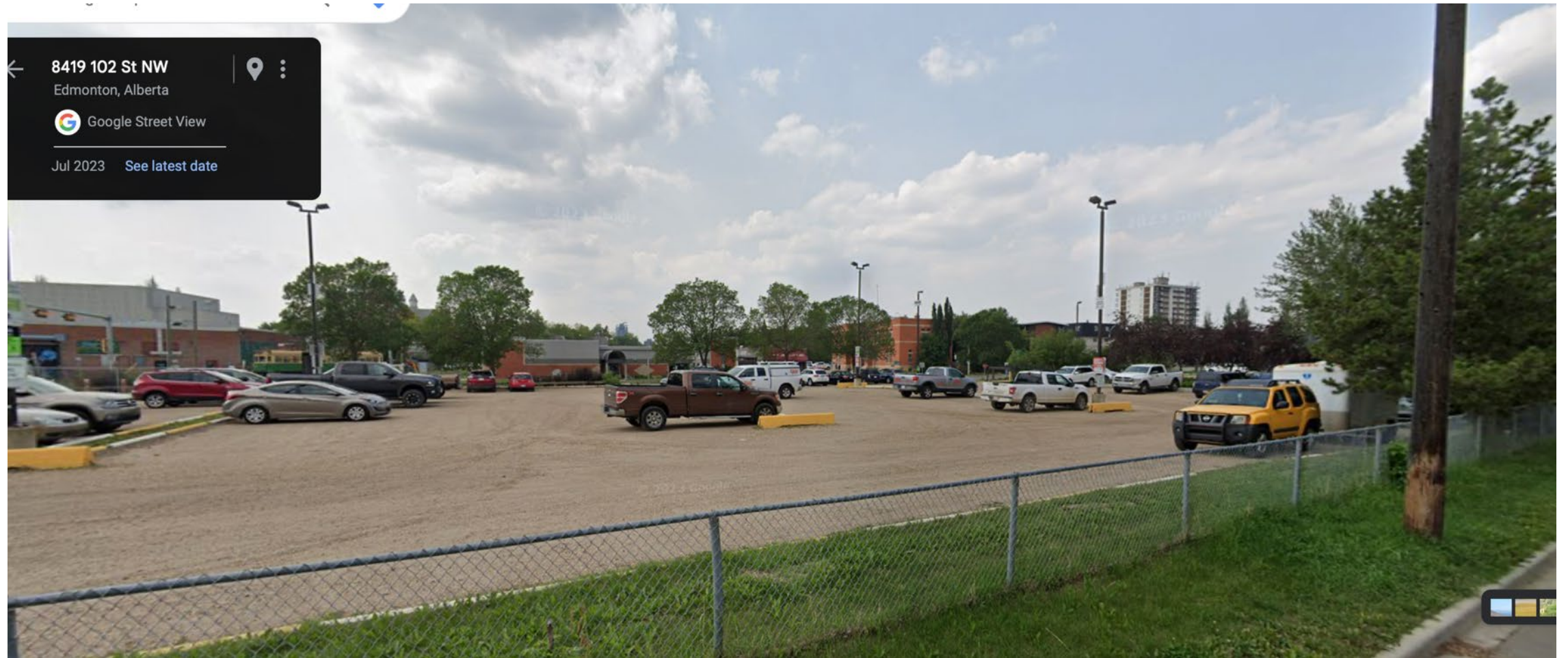
July 2023 (20-30 people using the parking lot)