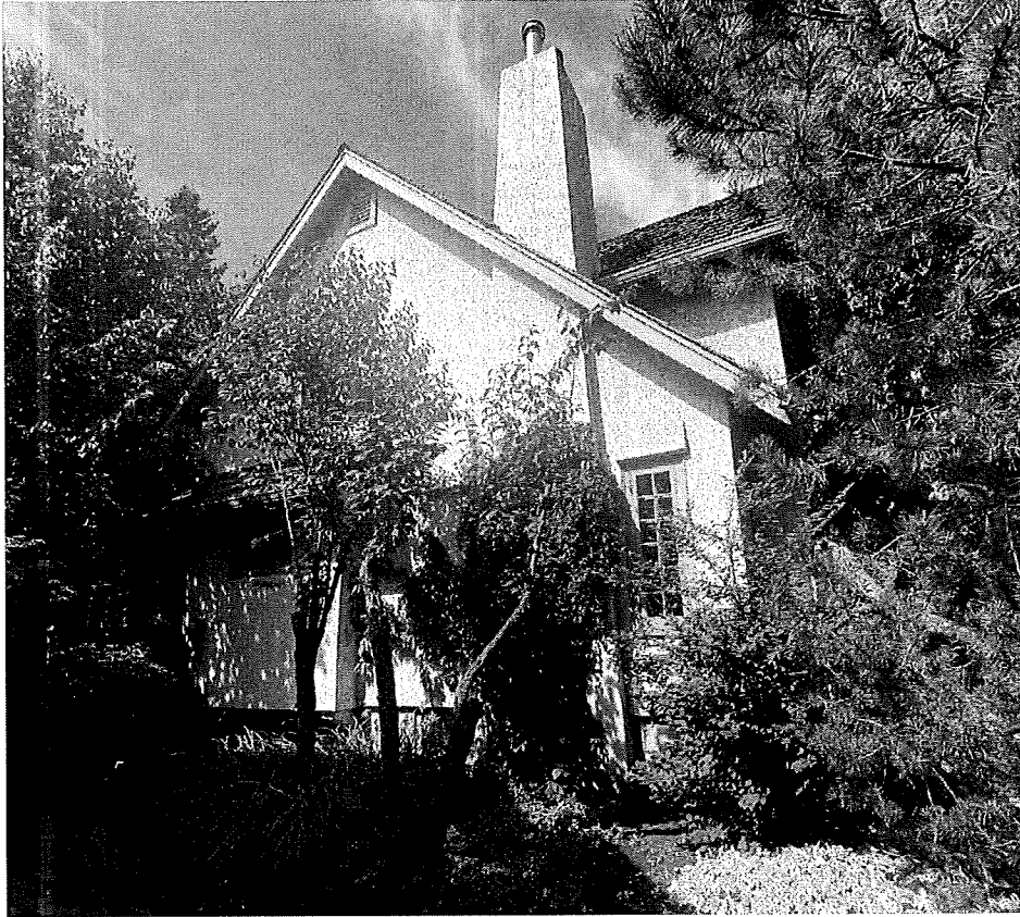
View of south (side) elevation, looking north.