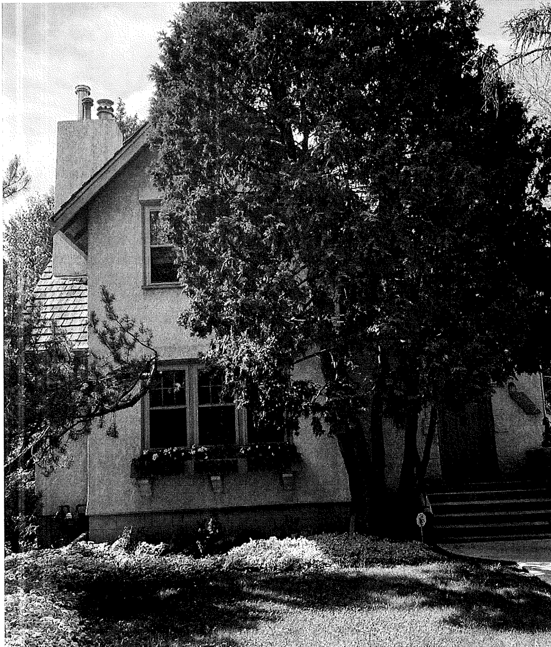
View of east (front) elevation, looking west from 127 Street NW