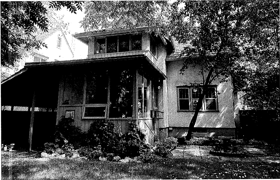
View of west (rear) elevation, looking east