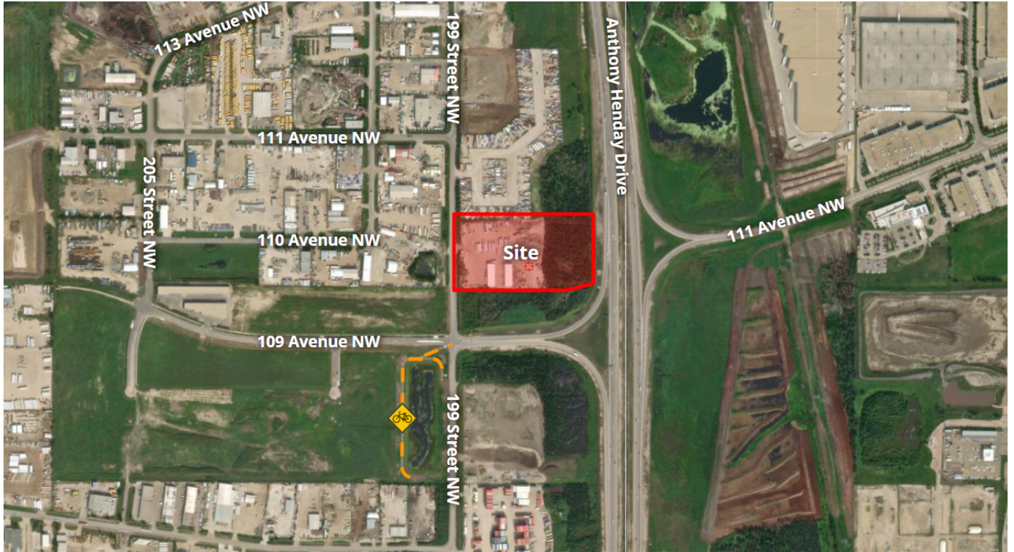
Site analysis context

contains outdoor and indoor storage uses. A shared use/bike path is located south of the site, providing active modes of transportation.