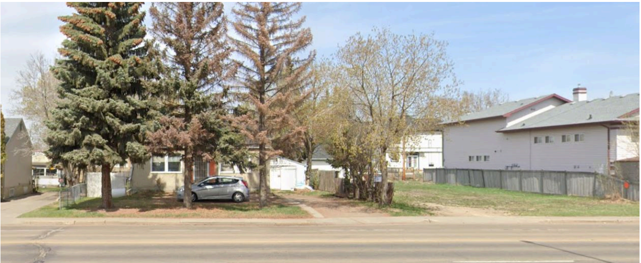
View of 16212 100 Avenue NW looking north from 100 Avenue NW