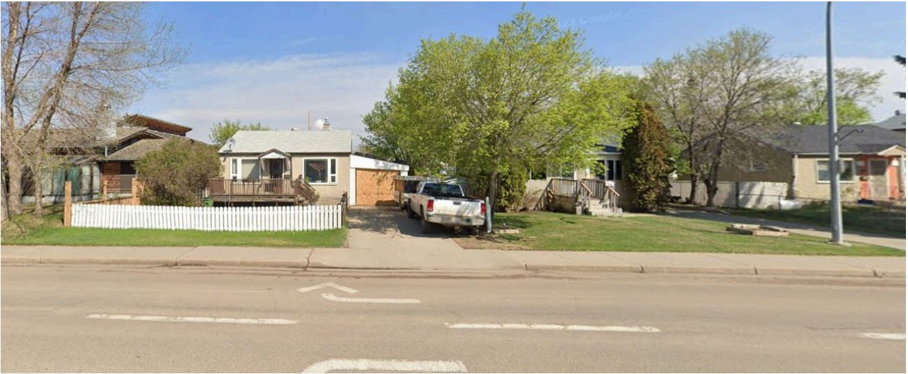
View of 16222 & 16216 100 Avenue NW looking north from 100 Avenue NW