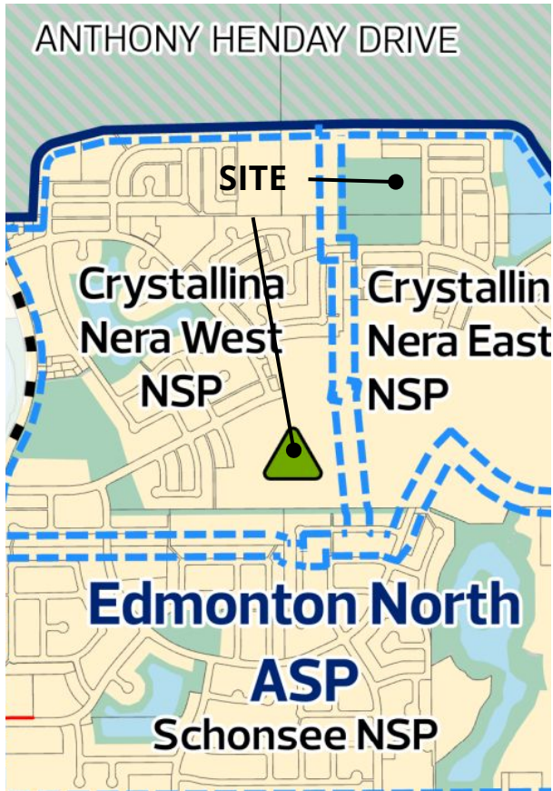
NORTHEAST DISTRICT PLAN