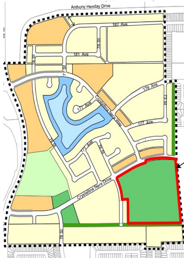
CRYSTALLINA NERA WEST NSP