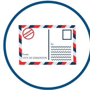
PUBLIC HEARING NOTICE October 10, 2024