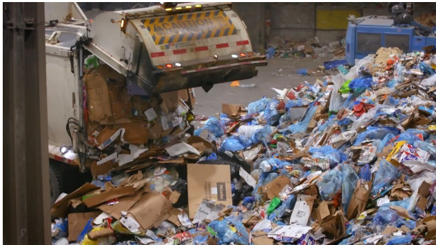
Developing a new waste management strategy for non-residential waste