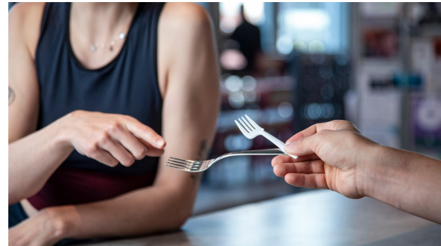
Increasing residential waste reduction and diversion rates