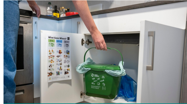
Three-stream waste sorting in apartment and condo collection