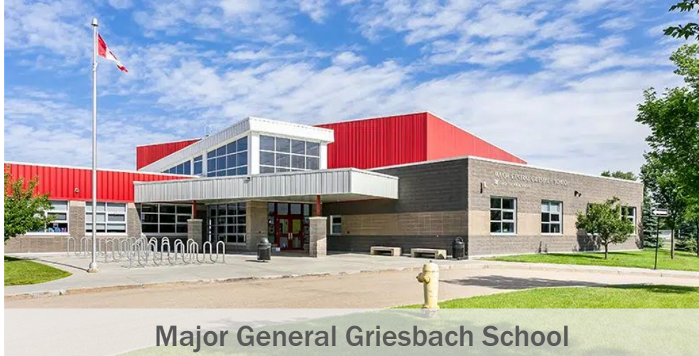
Major General Griesbach School