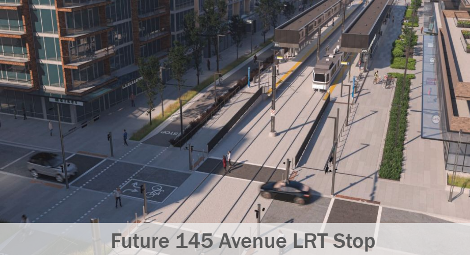
Future 145 Avenue LRT Stop