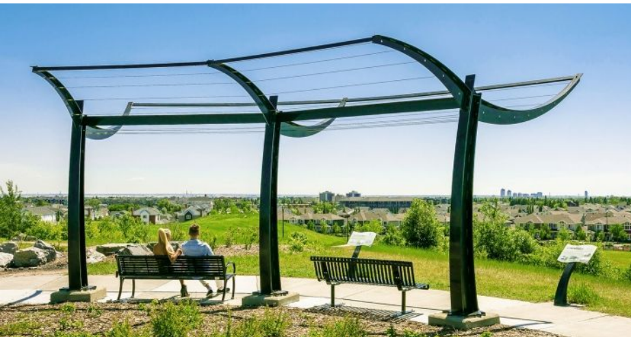
Griesbach Central Park