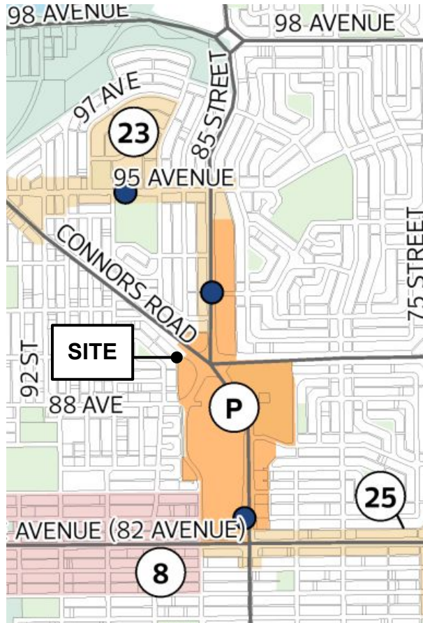
SOUTHEAST DISTRICT PLAN Nodes and Corridors