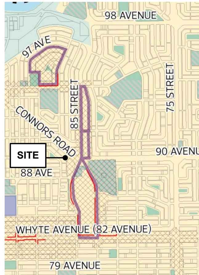
SOUTHEAST DISTRICT PLAN Land Use Concept to 1.25 Million