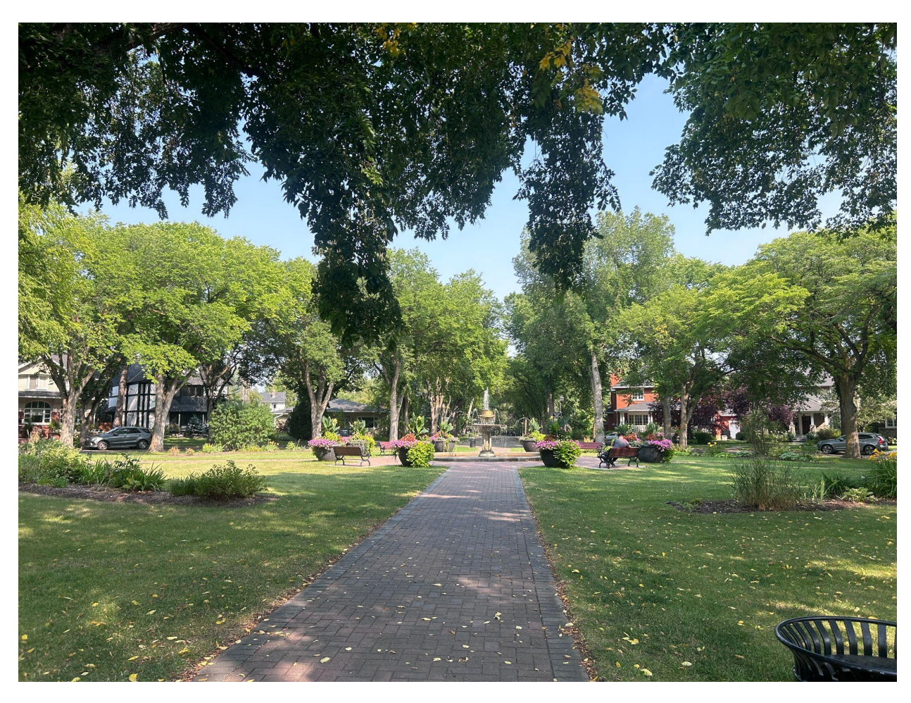
Elevation photo, looking east onto 103 Avenue