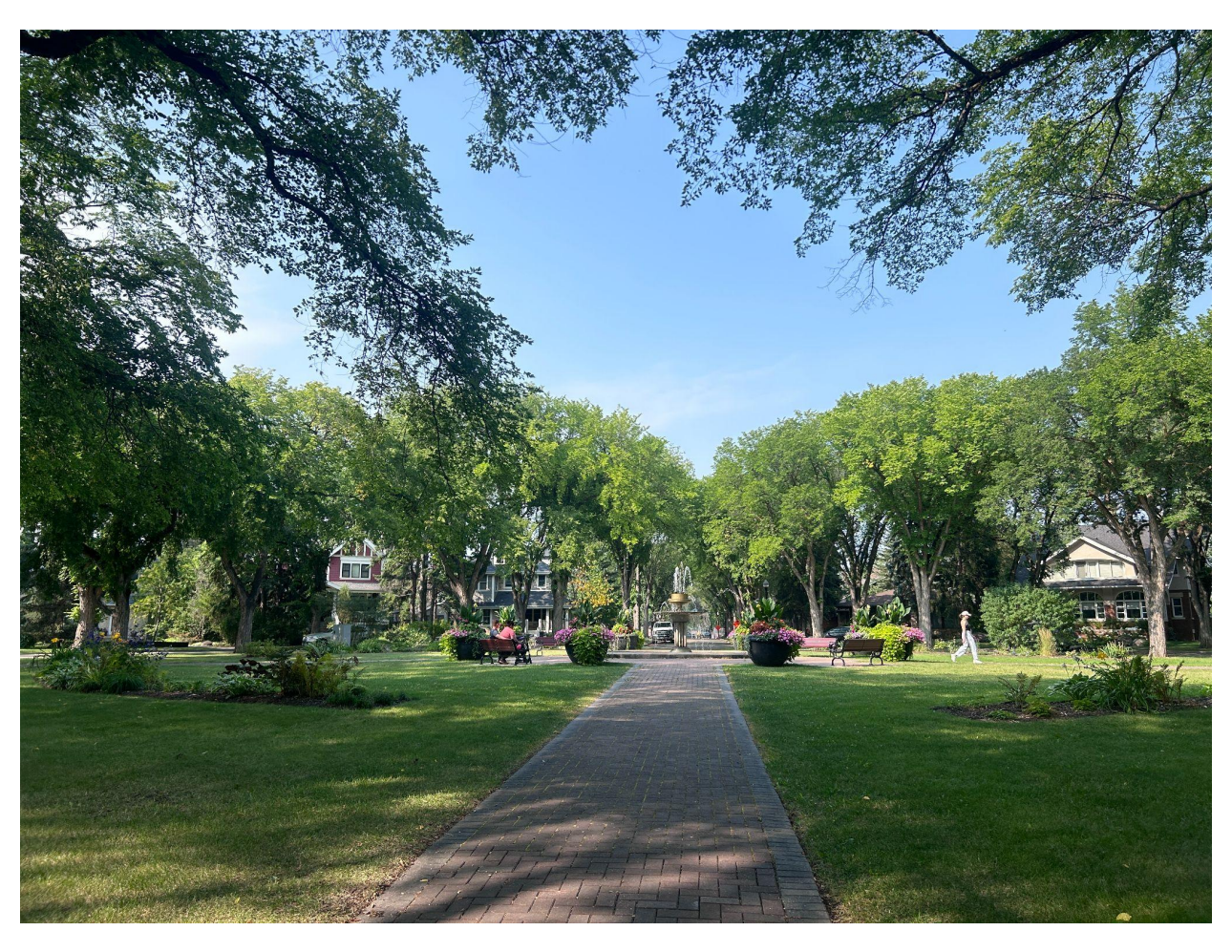
Elevation photo, looking north onto 133 Street