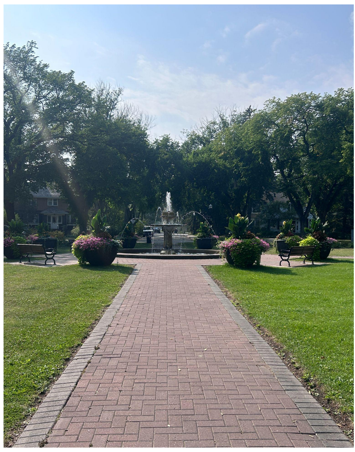
Elevation photo, looking west onto 103 Avenue