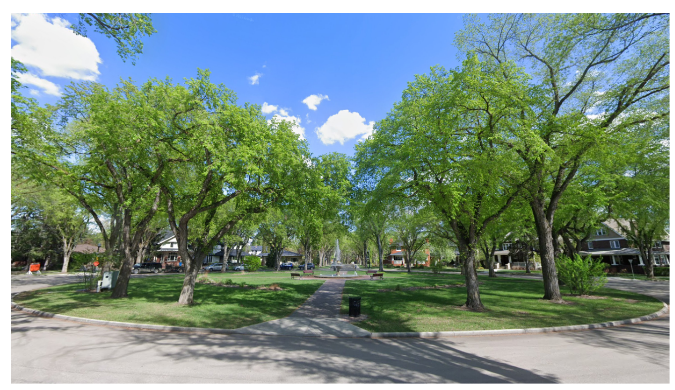
West elevation of Alexander Circle, looking east from 103 Avenue NW.