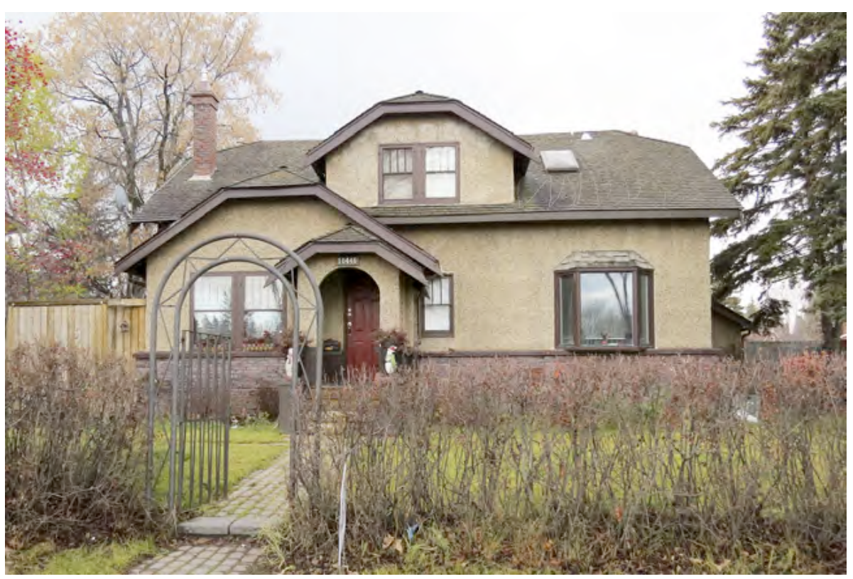
Front elevation of the De Wynter Residence, looking to the west from Connaught Drive.