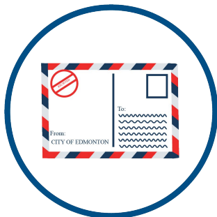
PUBLIC HEARING NOTICE November 12, 2024