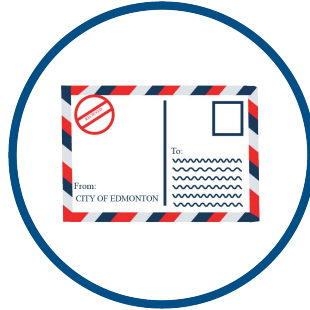
PUBLIC HEARING NOTICE November 2024