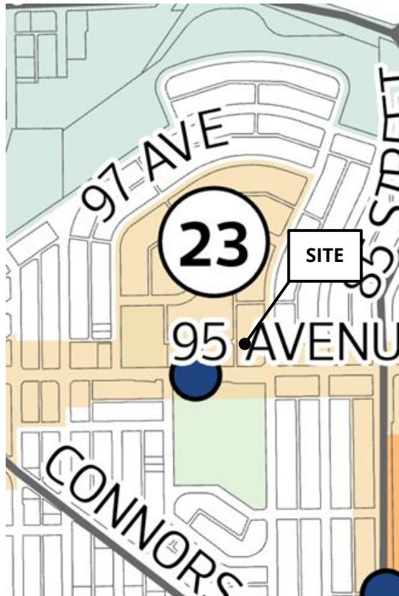
SOUTHEAST DISTRICT PLAN