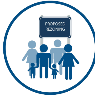
SITE SIGNAGE Nov. 13, 2024