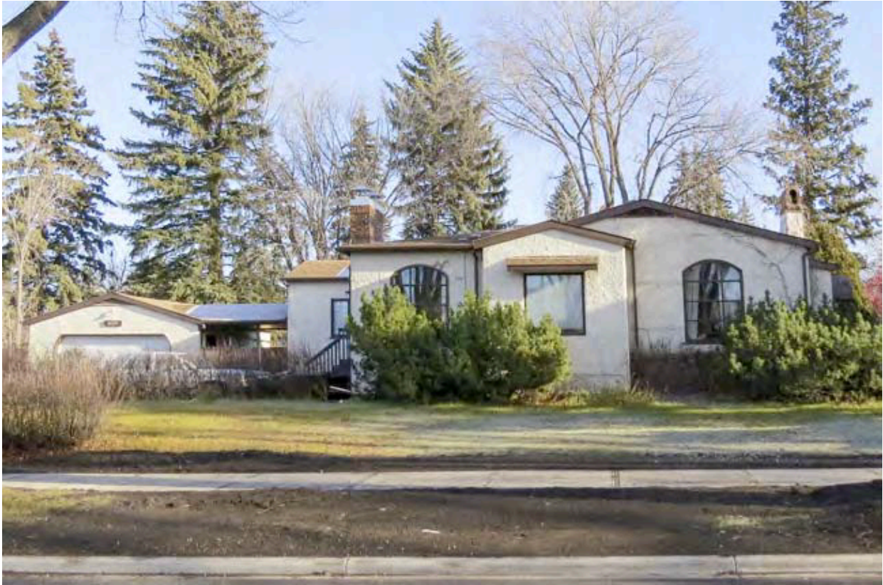
Photo of the Montgomery Residence

Front elevation of the Montgomery Residence, looking to the east from 134 Street. Note that the detached garage at the left of the photo has since been demolished related to LRT right-of-way requirements.