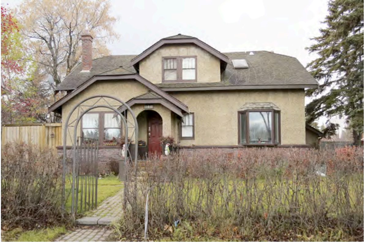
Front elevation of the De Wynter Residence, looking to the west from Connaught Drive.