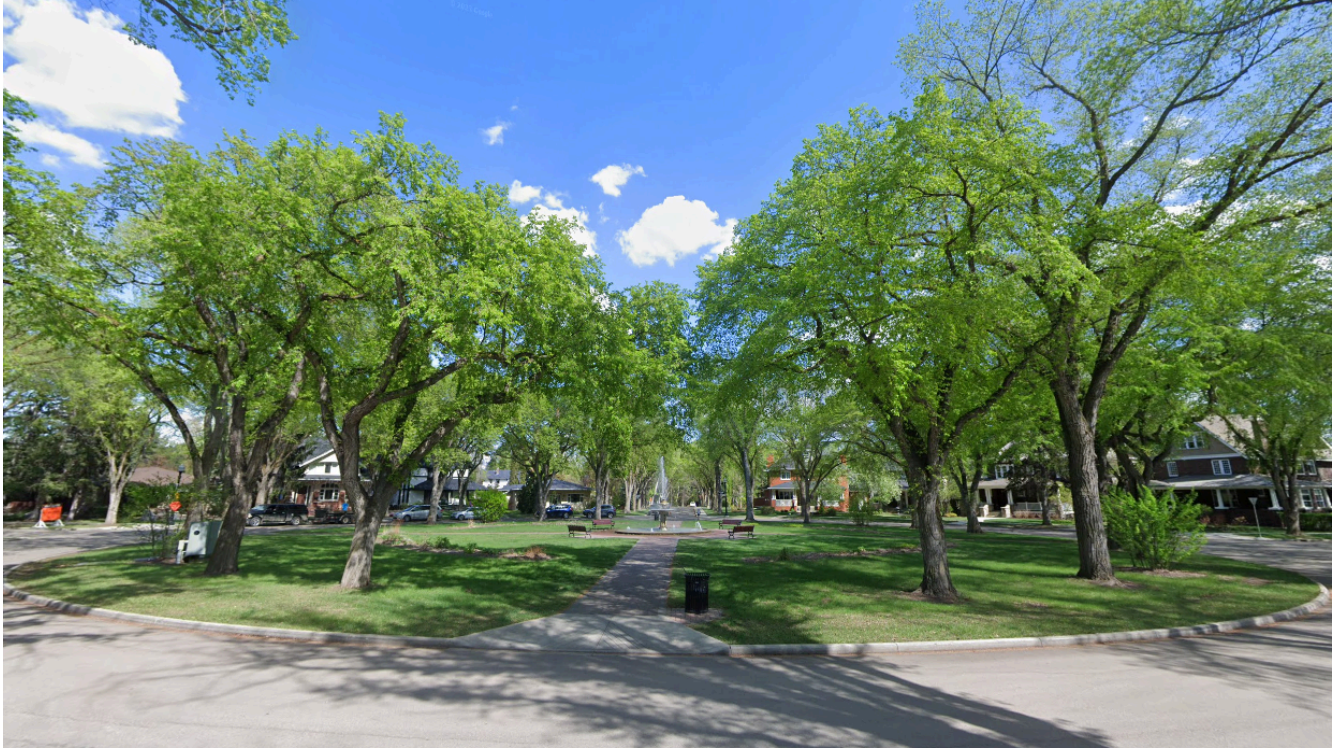
West elevation of Alexander Circle, looking east from 103 Avenue NW.