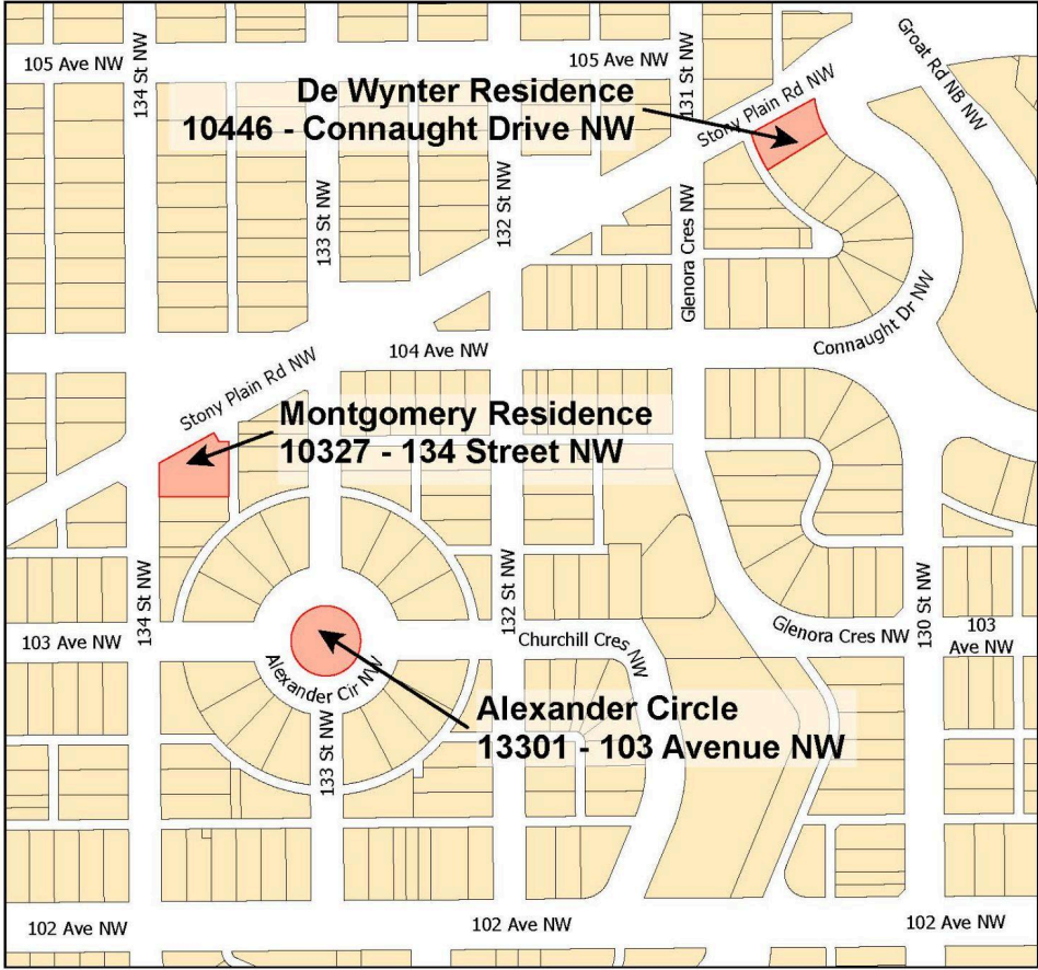
City-Owned Historic sites in Glenora