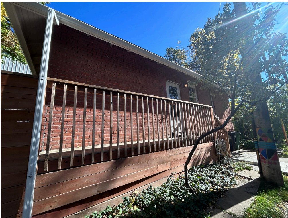
View of side (west) elevation, looking southeast from adjacent lane.