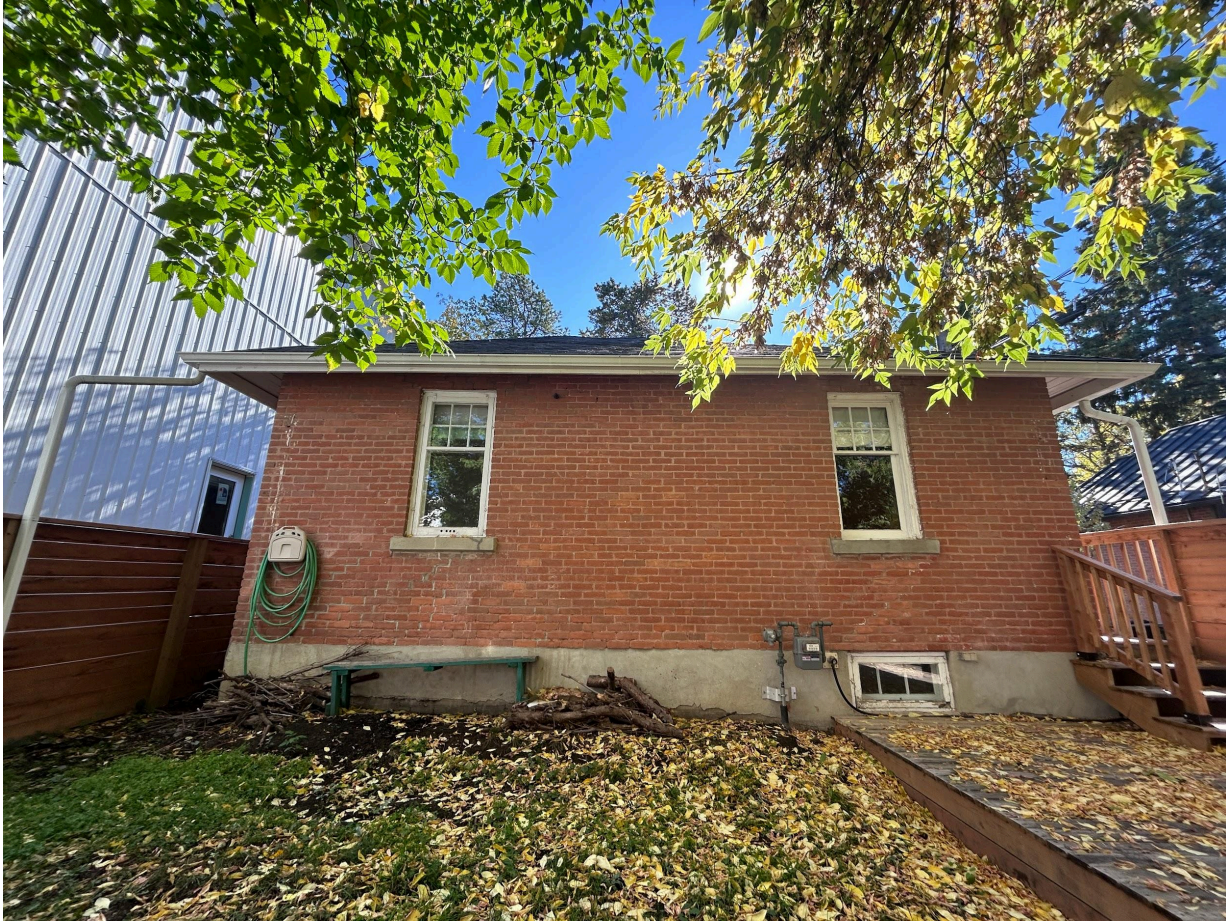
View of rear (north) elevation, looking south from property rear yard.