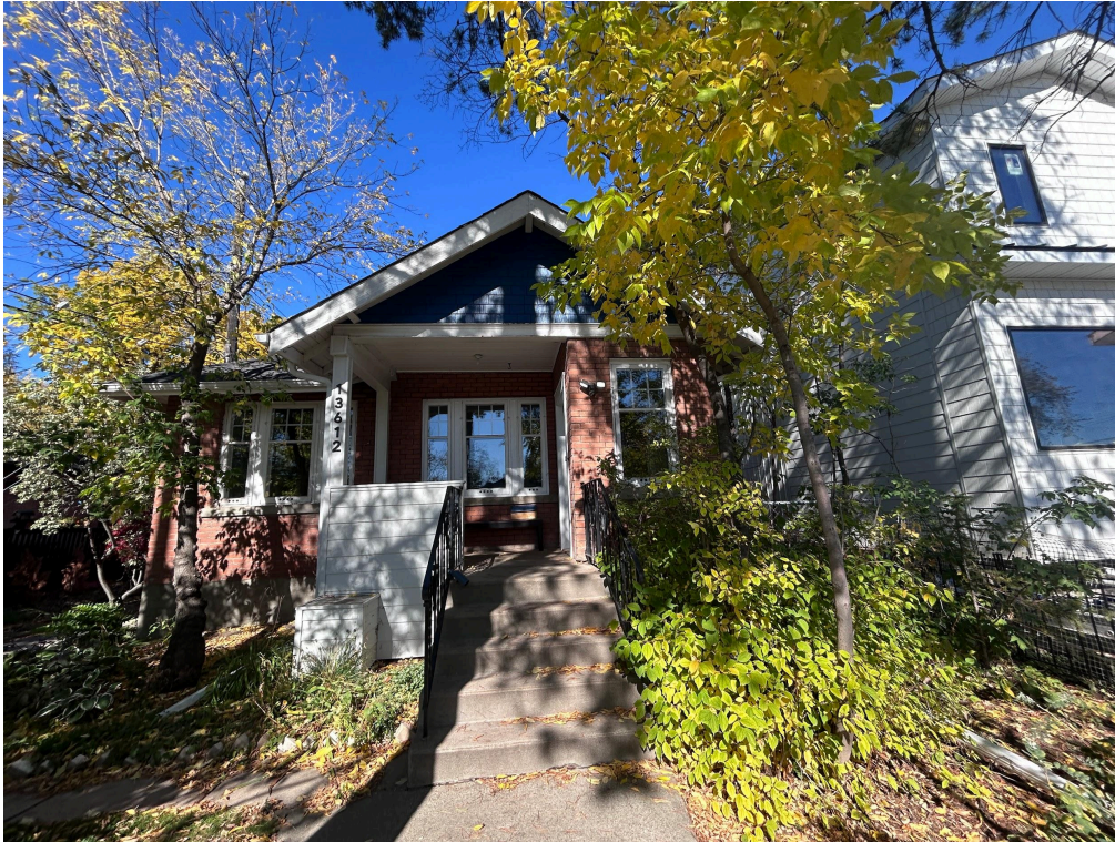
View of front (south) elevation, looking north from 103 Avenue NW.