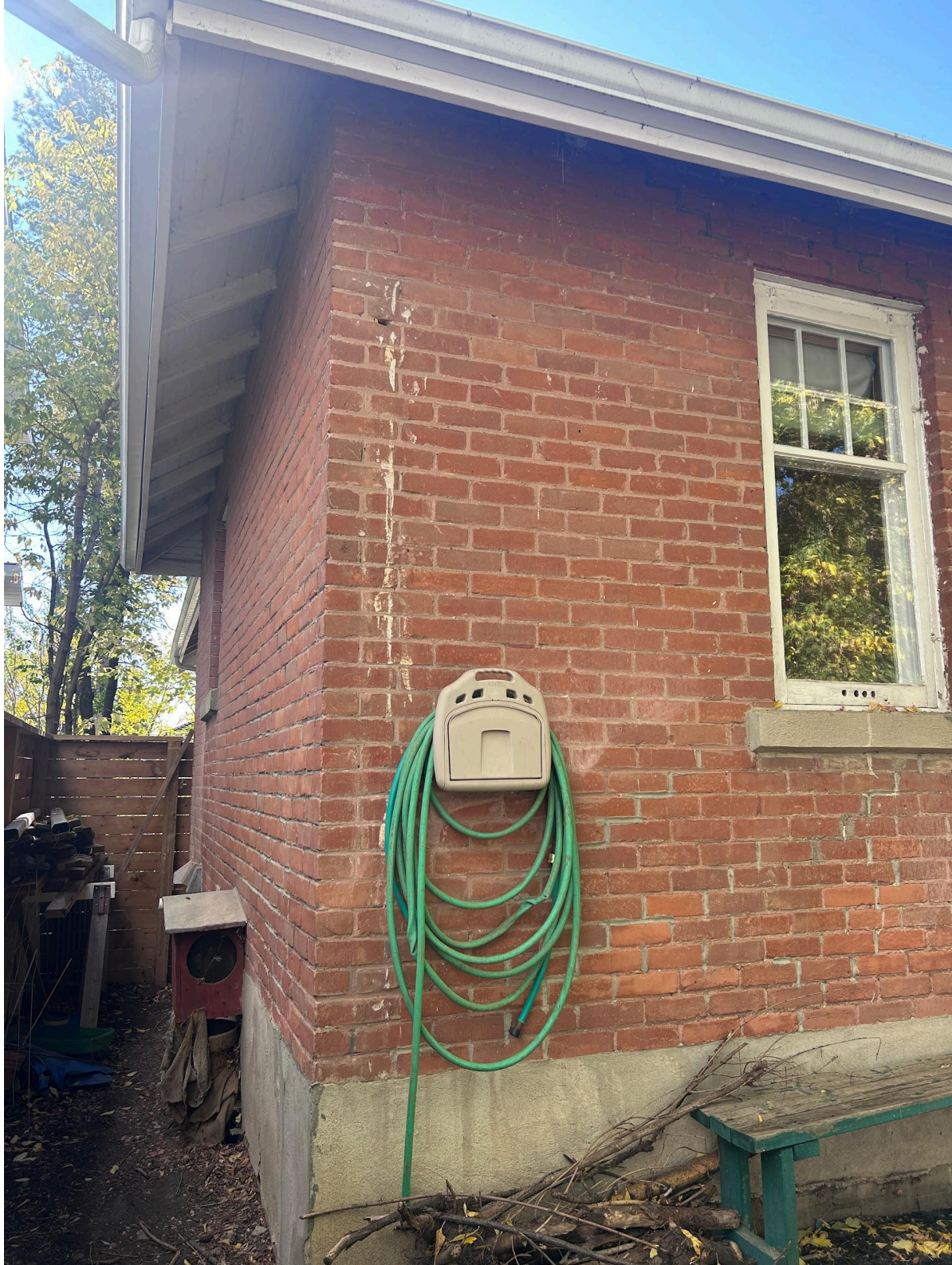
View of side (east) and rear (north) elevations, looking southwest from property side yard.