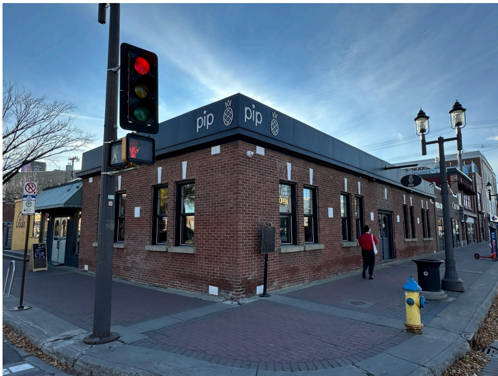
View of front (north) and side (west) elevations, looking southeast from the intersection of Calgary Trail NW and 83 Avenue NW.