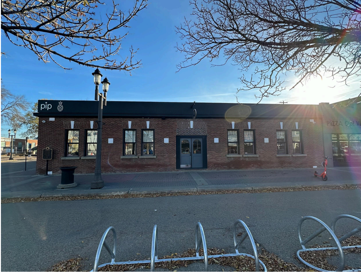
View of side (west) elevation, looking east from Calgary Trail NW.