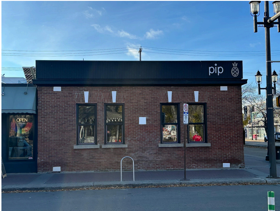
View of front (north) elevation, looking south from 83 Avenue NW.